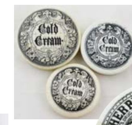
S34. TRIO OF COLD CREAM POT LIDS. 3 sizes, largest 3ins diam. Strong black transfers. Some wear. (3) (GJSC)

S35. PARKE'S CHERRY TOOTHPASTE POT LID. 2.5ins diam. Highly detailed & ornate pict. transfer with bunch of cherries detail, pict. t.m. toward bottom. Top edge flake @ 3 o'clock. (GJSC)