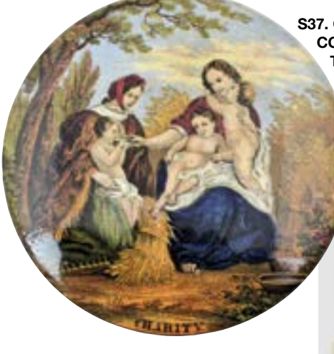
S37. CHARITY MULTI-COLOURED PRATT TYPE POT LID. Country setting family image. Some staining & couple of minor flange nicks, good colours. (GJSC)

S38. NORTHAMPTON GINGER BEER. 7ins tall, all white, st, black transfer. E.C. ASHFORD/ GINGER/ BEER/ NORTHAMPTON with central sheet music t.m. detail. Bourne Denby p.m. Base flake & minor lip nibbles. (CMac)