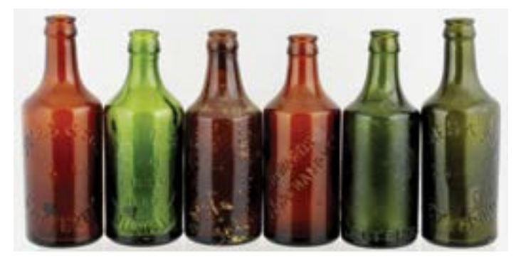
S41. NORTHAMPTON COLOURED GLASS GINGER BEER GROUP. Tallest 7.5ins. all crown cap, range of green & amber glass: from Kettering, Oundle & Wellinboro etc. (6) (CMac)

S42. UPPINGHAM FLAGON. 8.25ins tall. T.t, rear handle. Impressed front ARTHUR SEATON/ GROCER & C/ UPPINGHAM. Westwood & Moore, Brierley Hill p.m. Very good. (9/10) (CMac)