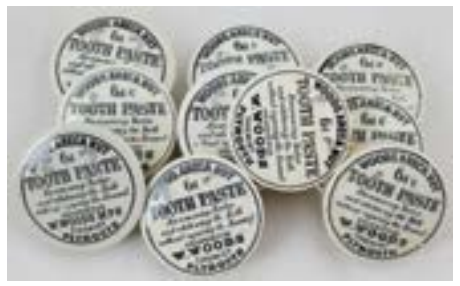
S40. WOODS POT LID GROUP. Variations of WOODS AREAC NUT/ 6d pot lids. Largest 2.75ins. (9/10) (10) (GJSC)