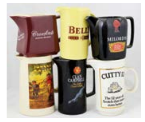
S48. PUB JUG GRP. Various shapes, sizes & base marks. Inc. Johnnie Walker, Milords, Cutty 12, Bells etc. In need of a wesh - but all good! (6)

BBR supports EVERY UK Bottle Show FREE advice NEVER beaten on like-for-like vendor commission rates. Regular nationwide pick ups