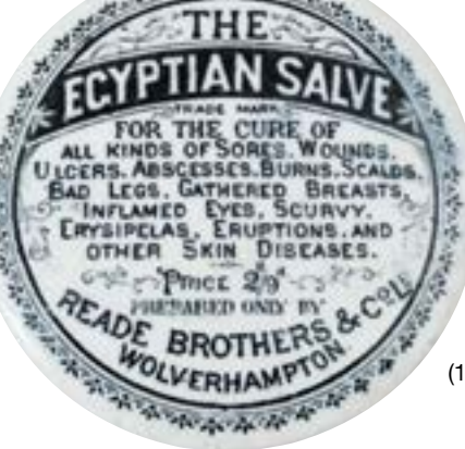
S39. WOLVERHAMPTON POT LID. 3.25ins diam, strong black transfer for THE/ EGYPTIOAN SALVE/ ... READE BROTHERS & CO LTD/ WOLVERHAMPTON. Decorative outer border. (10/10) (PLC)

S38. NORTHAMPTON GINGER BEER. 7ins tall, all white, st, black transfer. E.C. ASHFORD/ GINGER/ BEER/ NORTHAMPTON with central sheet music t.m. detail. Bourne Denby p.m. Base flake & minor lip nibbles. (CMac)