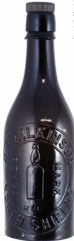
ST15. SAML VINCENT/ GENUINE EXTRA/ DUBLIN STOUT... NEWCASTLE/ AND/ SOUTH SHIELDS. Ch. t.t. Crisp black transfer. Buchan p.m. Very good. £8