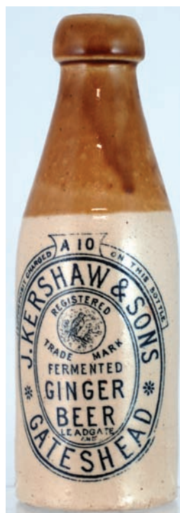
ST41. J KERSHAW & SONS/ GATESHEAD g.b. ch, t.t. Large oval black transfer, central pict. t.m. of bird on nest. Buchan p.m. Very good. £18