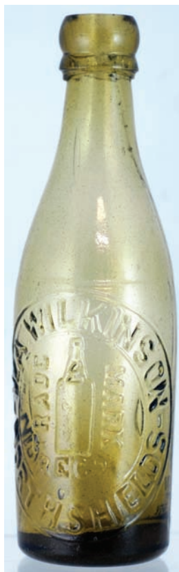
ST33. W A WILKINSON/ NORTH SHIELDS golden amber beer. Front heavily embossed & with lrg central trade mark of early narrow necked codd. 'WA Wilkinson No of Reg'd 85373' to rear. Exc. (CM) £53