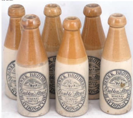
ST74. BEWICK BROTHERS/ Dublin Stout/ Blaydon on Tyne. All ch., t.t., 2 stags pict t.m. 4 Buchan p.m. 3 good, 3 with damage. £22