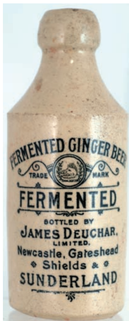
ST60. JAMES DEUCHAR.../ NEWCASTLE, GATESHEAD/ SHIELDS/ SUNDERLAND g.b. , all white, std. Small boars head pict. t.m. Stiff p.m. Good. £53