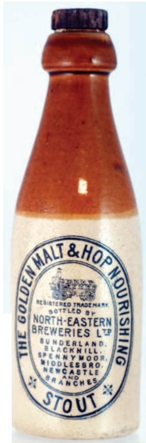
ST34. NORTH EASTERN BREWERIES stout, ch, t.t. Oval black transfer, with 11 lines of writing beneath pict. of drayman on early wagon. Buchan p.m. Bottom L area rep'd. 1 of 3 recorded examples. £130