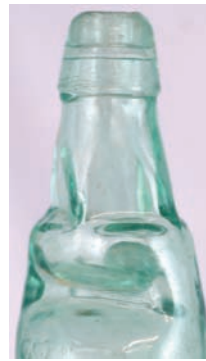
ST67. SQUARE NECKED NEWCASTLE CODD. 10oz aqua glass. Embossed vertically 'THE/ NEWCASTLE/ BREWERIES/ LIMITED' across front. To rear 'TURNER.../ MAKERS/ DEWSBURY'. Good. £42