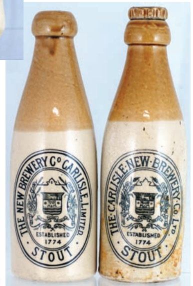
ST69. CARLISLE BREWERY stouts duo. Both ch, t.t. One says 'THE NEW BREWERY' the other 'THE CARLISLE NEW BREWERY'. Both have ornate shield foliage t.m. to centre. One blob top (Buchan) other is screw stoppered - with original transferred ceramic stopper. Good. (2) £7