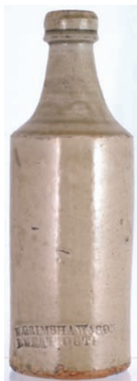
ST75. TYNE DOCK SHEARED LIP bluey aqua sauce (?) . Rectangular body with chamfered corners and elongated neck with sheared lip. Base embossed 'Sowerby/ Natural Glass/ Gateshead.' Very good. £7