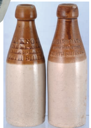
ST51. NORTH SHIELDS IMPRESSED STOUTS. ch, t.t.1. 'M Knott/ Wine Merchants/ Nile Street...' Lip flake. Gray p.m. 2. 'Richard Oats/ Albion Road Stores.' Buchan p.m. Good. (2) £2