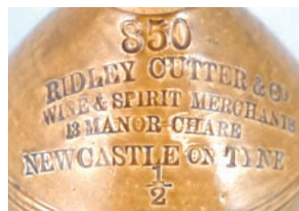
ST46. NEWCASTLE ON TYNE 1/2 gall flagon, t.t. Shoulder imp'd '850/ Ridley Cutter & Co/ Wine & Spirit Merchants/ 13 Manor Clare/ Newcastle onTyne/ 1/2'. Lip chips. £6