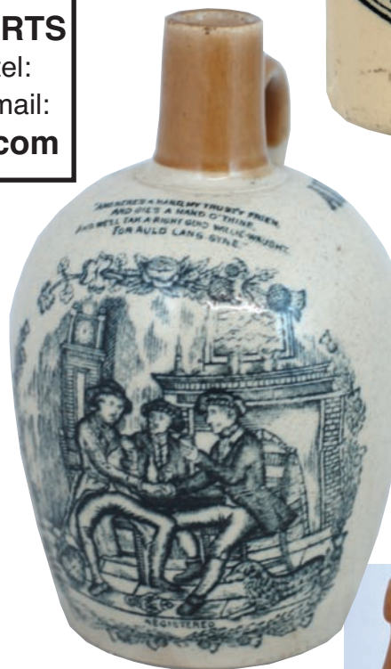
ST50. AULD LANG SYNE whisky jug. 8.4 ins tall, t.t., rear handle. Highly detailed transfer to front of seated gents playing cards and drinking all foliate surrounded, Verse to top, rear transfer etc. Kennedy p.m. Very good. £44