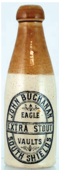
ST53. SOUTH SHIELDS stout, ch, t.t. 'JOHN BUCHANAN/ EXTRA STOUT/ EAGLE VAULTS...' Buchan p.m. Rear base flake. £50