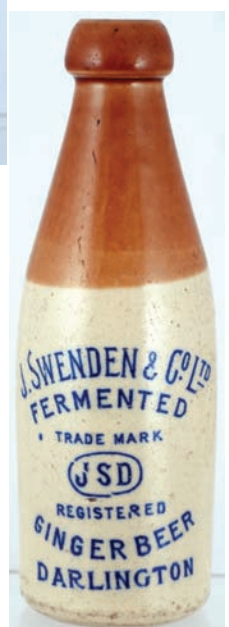
ST42. J SWENDEN/ ... DARLINGTON g.b. Ch, t.t. Dark blue transfer- 'Fermented/ Ginger Beer', entwined initials t.m. - all crisply struck. Very good. £30