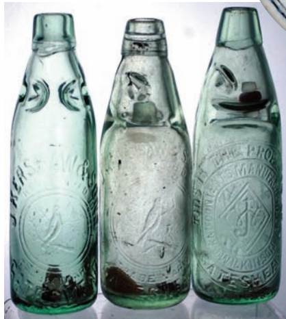
ST45. TRIO OF GATESHEAD MINERALS. 1. Dobson patent 4 lugs Kershaw & Sons, bird pict. 2. As previous but std codd (Codd's Bottle 4 to rear). 3. Joseph Wilkinson, bullet patent codd. All aqua (3) £4