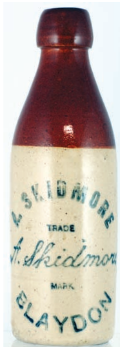
ST 58. L SKIDMORE/ BLAYDON ch, t.t. stout, red brown top. Unusual crude item for an area so rich in Buchan Very good. £18