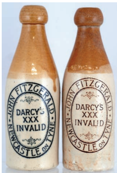
ST52. JOHN FITZGERALD/ D'ARCY'S XXX INVALID/ NEWCASTLE ON TYNE' stout duo. One black print on sepia . Both ch, t.t. Flake to sepia version & some glaze flaws. Otherwise good. (2) £20