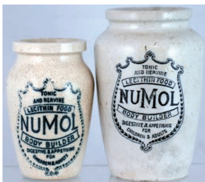
ST54. NUMOL BODY BUILDER all white jars, tallest 5.2ins. Minor transfer variations, largest has base flake & short rear neck hairline. (2) £5