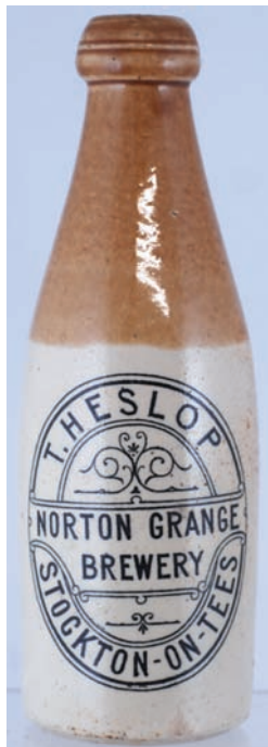
ST1. T HESLOP/ NORTON GRANGE/ BREWERY/ STOCKTON-ON-TEES. T.t., ch. Strong black transfer in oval boarder. Buchan p.m. Very good. £24

I have rounded them up, or down, to the nearest pound.