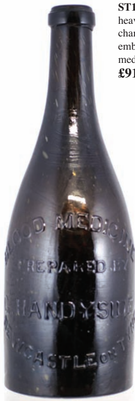
ST10. HANDYSIDES/ BLOOD MEDICINE heavily embossed across the front of a black glass champagne shaped bottle, 10.5ins tall. 4 lines embossed. Good. Crude North East 'classic' medicine scarcity. £91