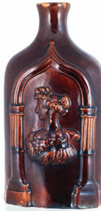
ST70. REFORM TYPE FLASK. 9ins tall, shiny brown Rockingham glaze. Arched panels each side - Queen Victoria to one side Caroline to other. Good. (DD) £14