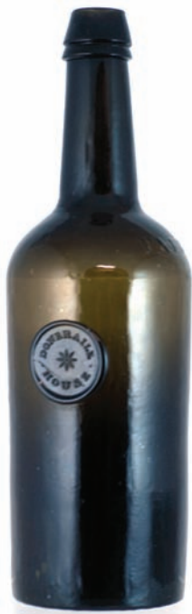
ST43. DONERAILE HOUSE sealed wine cyinder. 11.25ins tall, deep black glass, 3 piece mould, crisply struck seal below shoulder. Ricketts base mark. (CM) £65