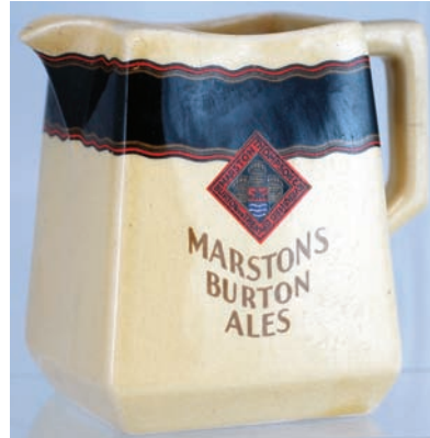
ST68. 'MARSTONS/ BURTON/ ALES' pub jug. Squared body, overall cream glaze with brown, black, red & blue transfer - wording & pict. t.m. to two sides. Royal Doulton p.m. to base. Good. £20