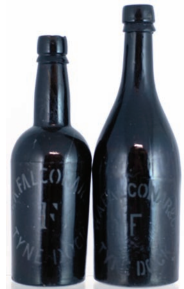
ST71. TYNE DOCK acid etched porters. Both black glass - 1/2 pint shouldered, pint ch, style. Both acid etched 'W A Falconer/ F/ Tyne Dock'. Lip nibbles to the 1/2. (2) £6