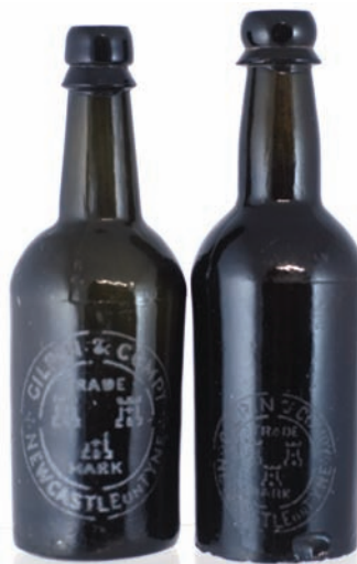
ST9. PR ACID ETCHED black glass beers. Shouldered half pint type. 'GILPIN & COMPY/ NEWCASTLE ON TYNE' with 3 turrets to centre - acid etched. Chips to one. (2) £5

Tried • Tested • Trusted www.onlinebbr.com more sales more often