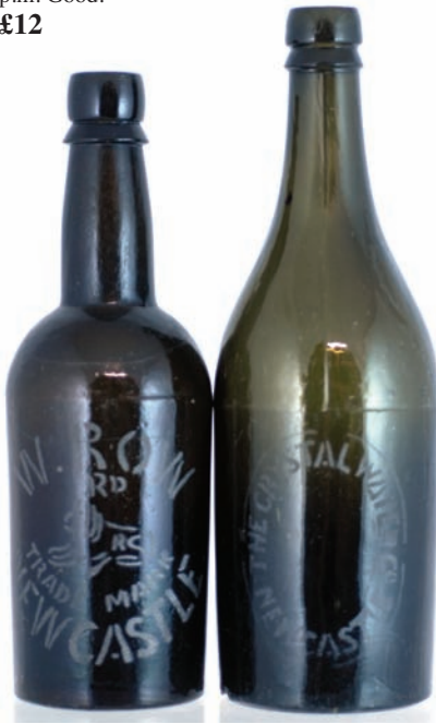
ST73. NEWCASTLE ACID ETCHED PORTERS. 1. Half pint shouldered 'W ROW/ NEWCASTLE', pict. of seated lion t.m. 2. 'THE CRYSTAL WATER Co/ NEWCASTLE.' Both very good. (2) £12