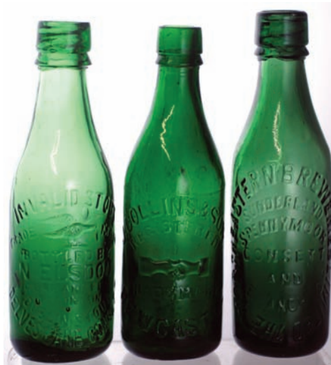
ST39. GREEN GLASS BEERS TRIO. 3 half pint beers: 1. 'N ELSDON/ DUBLIN STOUT/ DELVES LANE CONSETT', bird pict. 2. 'J COLLINS & SON/ NEWCASTLE' shaking hands t.m. 3. NORTH EASTERN BREWERIES - 3 named branches. Good (3) (CM) £9