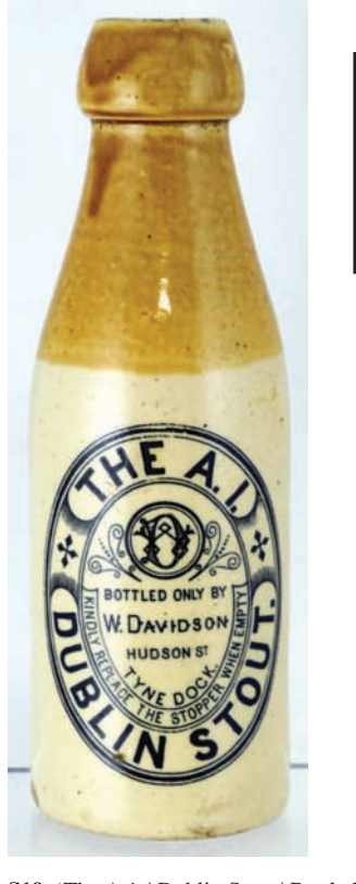
S19. 'The A.1./ Dublin Stout/ Bottled by W. Davidson Hudson St Tyne Dock'. Ch., t.t. Buchan p.m. 2 base flakes, rear touch mark. Superb strong/ crisp black transfer.

{\bf S23.} \ {\rm Durham\ imp'd\ grey\ green\ slip\ glaze\ porter} '1858/ G. Caldcleugh/ Durham'. Very good - nay fabulous!