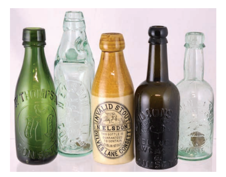
S29. 'N. Elsdon Consett' group: stout, codd & beer & 'Wood & Sons/ & Co/ Bedlington/ Newcastle/ & Consett' black glass beer & 'W Thompson/ Consett' beer. Aqua, green & black glass, stout is a t.t., ch. (5) Good.