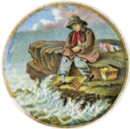
E2. THE FISHERBOY POT LID. (KM 291) 3ins diam. Multicoloured lid produced by the Pratt factory. Underside flange flake & crazing. Good strong colours. (7.5/10) (RC)