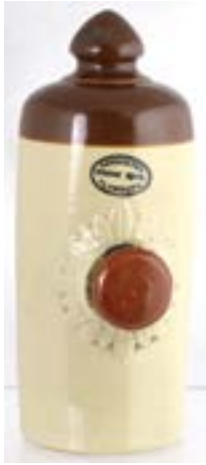
E26. PLYMOUTH FOOTWARMER. 10ins tall. Brown top & stopper , leaf detail around & cream glaze below. Black transfer for BANNISTER/ WYNDHAM SQUARE/ PLYMOUTH within oval border. Very good. (GM)