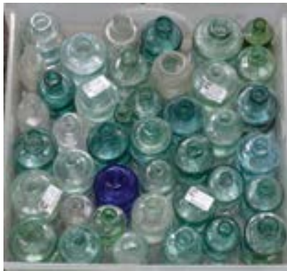
E28. TRAY OF INKS & GLUES. Various sizes, all circular shape, clear, aqua, blue, some embossed - have a good "root thro". (40)