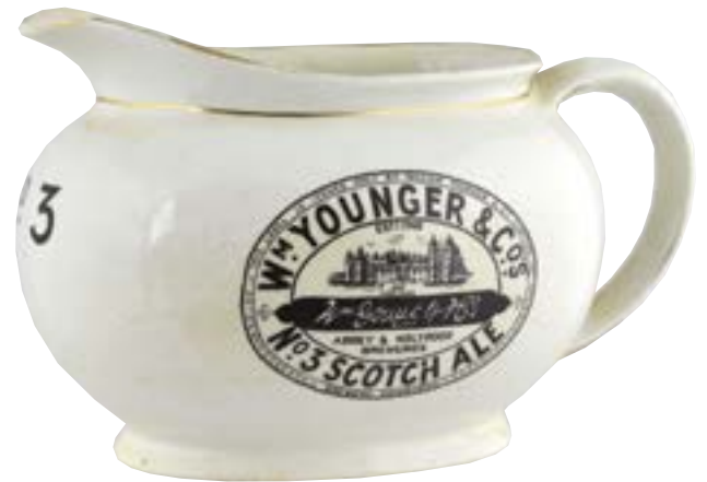
E15. YOUNGER & COS PUB JUG. 4ins tall, all white glaze edged in gold to top edge & below lip & rear handle. Side transfers WM YOUNGER & CO .../ NO3 SCOTCH ALE & pict. t.m. centre. No. 3 below lip area. Some gold wear. Shelley base mark.