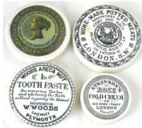
E40. POT LIDS GROUP. Largest 3.5ins diam. INC. Atkinsons Cold Cream, John Gosnell Cherry Tooth Paste, Woods Areca Nut Tooth Paste & Army & Navy Home Made Potted Meats. Minor flange imperfections. (4)