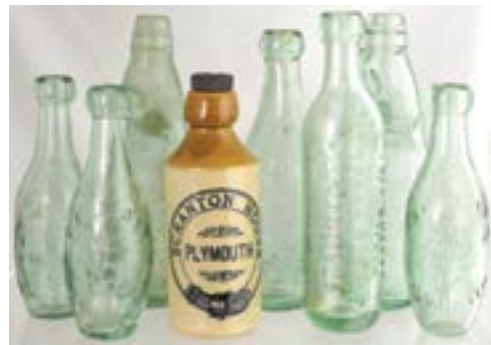
E41. PLYMOUTH BOTTLE GROUP. Codd's/ flat based hamiltons/ minerals & one g.b. (8) (GM)