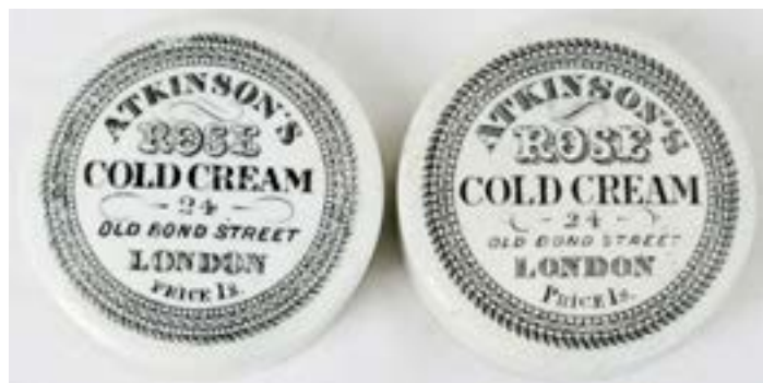
E48. COLD CREAM POT LID DUO. 2.5ins diam. Two very slight variations of ATKINSONS/ ROSE/ COLD CREAM.../ LONDON in black with decorative outer border. Generally good. (2) (9/10) (GJSC)

BBR attends ALL UK Shows & also makes regular trips around the country picking up consignments. Contact Alan Blakeman: alan@onlinebbr.com