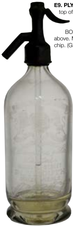
E9. PLYMOUTH SODA SYPHON. 11.75ins tall to top of trigger. Clear glass, acid etched to front J DENNIFORD & SONS/ LIMITED/ RUSSEL STREET/ PLYMOUTH... LONDON/ MELBOURNE/ ADELAIDE/ SYDNEY, coat of arms above. Made in Vienna. Thumb nail size side base chip. (GM)