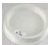
E25. BARNSTABLE CHERRY TOOTH PASTE POT LID. 2.75ins diam. Faded pink base colour with black lettering for TREMMER'S/ CHERRY/ TOOTH PASTE.... with entwined initials t.m. & double line & decorative outer border. Minute flange glaze nick @ 4 o'clock. (8.5/10) (GJSC)