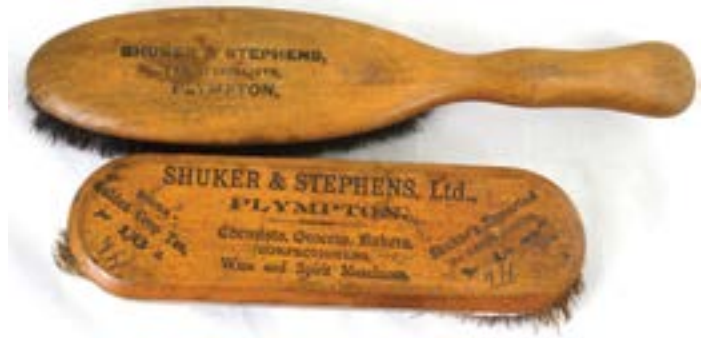
E39. PLYMPTON ADVERTISING BRUSHES. Wooden brushes advertising various products from SHUKER & STEPHEN.../ PLYMPTON. (2) (GM)