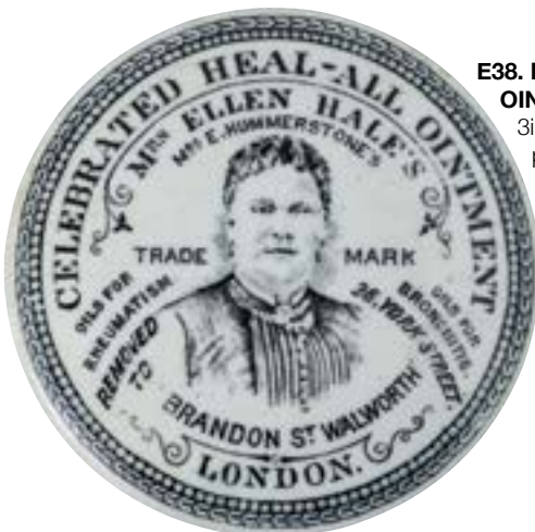
E38. MRS ELLEN HALES OINTMENT POT LID. 3ins diam. Crisp black pict. transfer of the lady herself & CELEBRATED HEAL-ALL OINTMENT/ MRS ELLEN HALES.... LONDON & decorative outer border. Very good. (10/10) (GJSC)