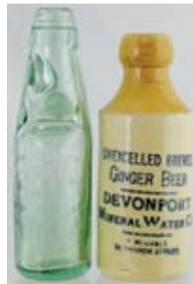
E24. DEVONPORT DUO. Inc. 6oz codd bottle embossed W. DUBBIN'S/ MINERAL WATER. Cnnington Shaw makers to reverse. Plus st, t.t. ginger beer for DEVONPORT/ MINERAL WATER CO. Price Bristol p.m. (2) (GM)