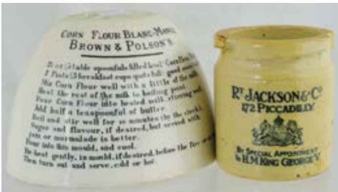
E19. BLANC-MANGE OULD & CAVIAR JAR. Off white glaze, black transfer CORN FLOUR BLANC-MANGE/ BROWN & POLSONS.../ directions below. Some slight general wear/ staining. Plus RT JACKSON & CO caviar jar. with coat of arms t.m. Doulton Lambeth p.m. (2) (GM)