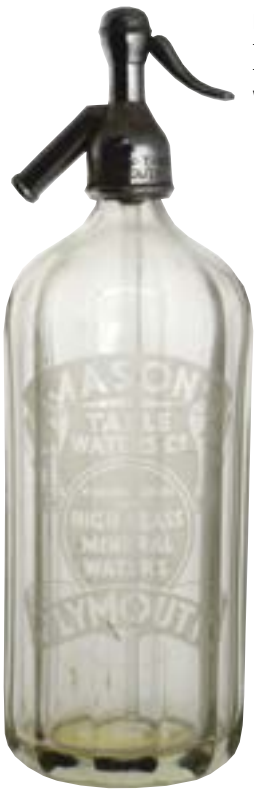
E17. PLYMOUTH SODA SYPHON. 13ins tall to top of impressed metal trigger. Clear glass, faceted body, acid etched MASON'S/ TABLE/ WATERS CO/...PLYMOUTH. Good. (GM)