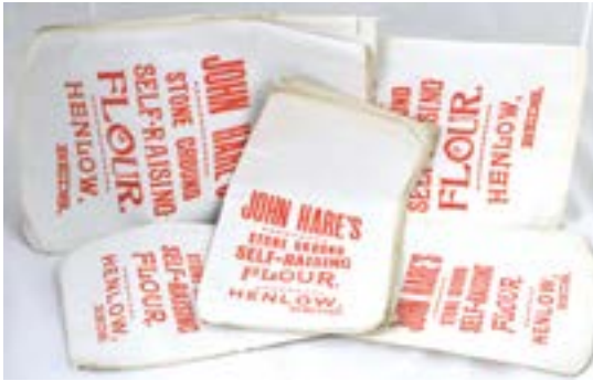
E35. HENLOW FLOUR SACKS. Hessian flour sacks with red lettering JOHN HARE'S/... FLOUR/ HENLOW/ BEDS. (20) (NL)