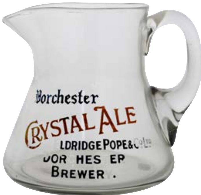
E49. DORCHESTER ALE JUG. 5.25ins tall. Clear glass with enamelled lettering DORCHESTER/ CRYSTAL ALE/ ELDRIDGE POPE & CO LTD/ DORCHESTER/ BREWERY in black & red . Some wear/ colour loss. Rear handle. Very good.