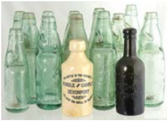
E34. DEVONPORT MIX BOTTLES GROUP. Inc, codd's (various sizes), a beer & g.b. Generally all good. (14) (GM)