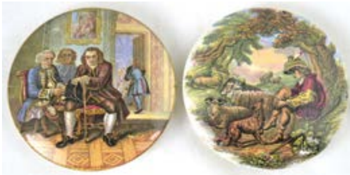
E36. PRATT LID DUO. 4.25ins diam. Multicoloured images Dr. Johnson (KM 190) & The Shepherd Boy (KM 280) - rim flakes. (2) (7/10) (RC)