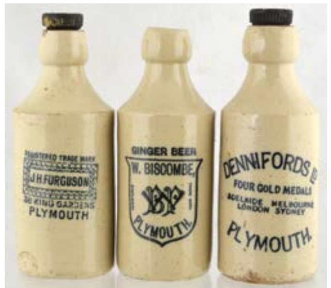
E16. TRIO OF PLYMOUTH GINGER BEERS. 7ins tall. All white, st, black transfers. JH FURGUSSON, W. BISCOMBE & DENNIFORDS LD. Midland & Price Bristol p.m's. Some wear. (3)

AFTER SALE RESULTS FREE off BBR website, or email: sales@onlinebbr.com