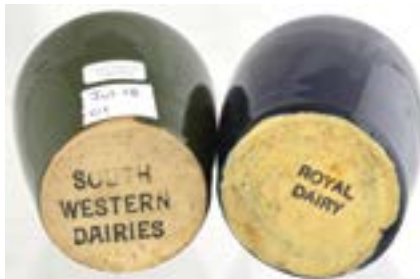
E29. SOUTH WEST CREAM POT DUO. Tallest 3.75ins. One blue, one green glaze , both base transferred - one 'ROYAL DAIRY' & the other 'SOUTH WESTERN DAIRIES'. Very good. (CC)