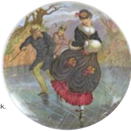
E27. THE SKATERS POT LID. (KM 304) 4.25ins diam. Multicoloured lid produced at the Pratt factory. Underside top edge nick & hairline @ 10 o'clock. (8/10) (RC)