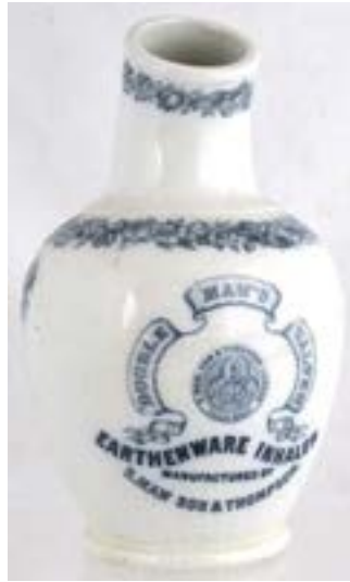
E18. MAWS EARTHENWARE INHALER. 9ins tall. Off white glaze, decorative floral blue transfer & DOUBLE MAWS VALVED/ EARTHENWARE INHALER/.../ S. MAW SON & THOMPSON & central entwined initials t.m. Directions to rear. All over light crazing. (GM)