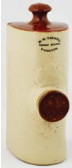
E1. PAIGNTON FOOTWARMER. 11ins tall, brown top & stopper W.W.VARWELL/ TORBAY STORES/ PAIGNTON transferred in black . Small flake off top L corner. (GM)

Comm. 15% on hammer, immediate payment taken, we bring items to you. Kick off 'noon ish' - should take approx 30 mins