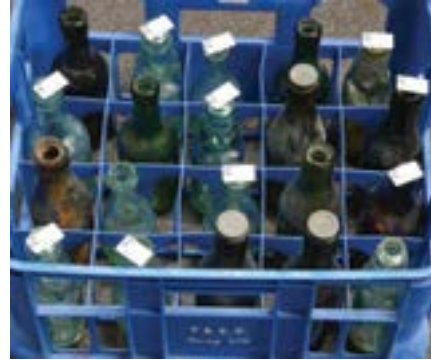
E14. CRATE OF PLYMOUTH BOTTLES. Includes codd's, beers etc. Have a good root thro' - useful stall/ ebay stock? Includes the crate! (20) (GM)