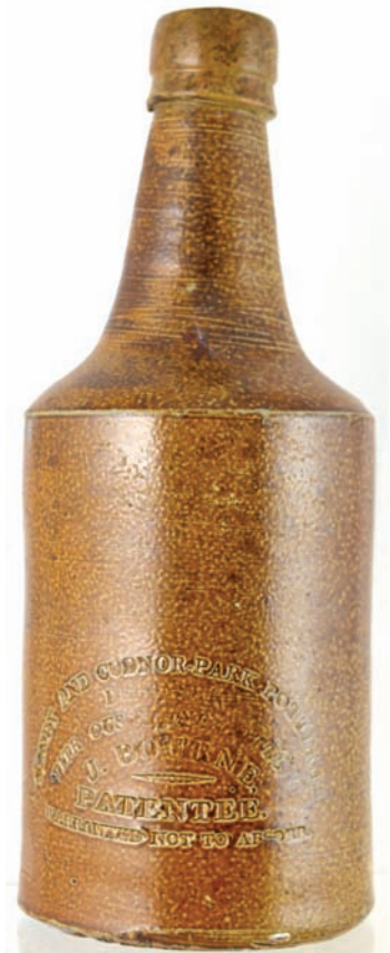
C61. EARLY WARWICK PORTER. Superbly salt glazed porter. 8ins tall, 'Warwick'. Rear carries large imp'd 'J BOURNE/ PATENTEE' curved manufacturer attribution - 6 lines. Lip repaired. Extremely rare.