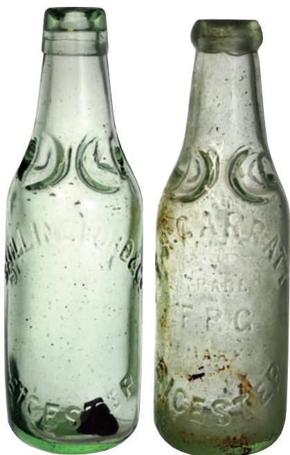
C27. BICESTER Chapman Patent duo, aqua glass. 1. Shillingford & Co 2. FR Garratt (2) (GM)