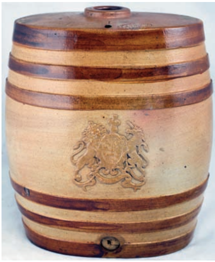
C35. SALT GLAZE BARREL. 10.2ins tall, flattened oval barrel - filling hole to top, bung hole to base. 4 'hoops' (highlighted) plus coat of arms to front. J Stiff p.m. Good