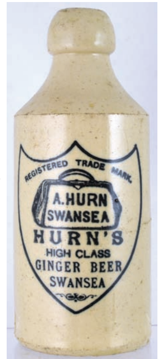
C25. 'A HURN/ SWANSEA' all white, g.b. Detailed pict. black transfer (leather bag). Price p.m.