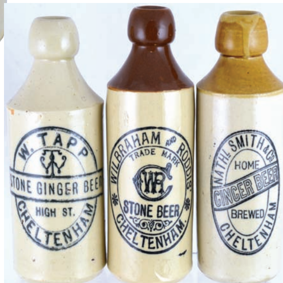
C26. CHELTENHAM g.b trio. All white, std, plus 2 t.t. 1. W TAPP 2. Wilbraham & Roddis 3. Nath'l Smith & Co. All 3 Price p.m. (3)

ABSENTEE BIDS Absentee bids to be with BBR no later than Thursday prior or email: sales@onlinebbr.com