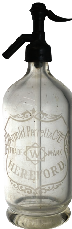
C32. HEREFORD clear glass soda syphon 'Arnold Perrett & Co' acid etched to front. Very good.