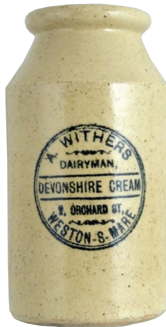
C2. 'A WITHERS/ WESTON - S-MARE' cream pot. 5ins tall, off white & straight sided shape. A rare regional piece. Priest Cardiff p.m. Exc.