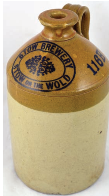
C24. 'STOW BREWERY/ STOW IN THE WOLDS' half gallon t.t. flagon. Rear handle. Black shoulder transfer plus '116H' to side. George Skey p.m. Lip flake. (CM)