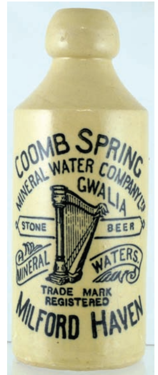
C53. MILFORD HAVEN all white, std. Very strong & large black transfer 'Coomb Spring/ ... Minerla Waters' with large harp pict. t.m. to centre. price p.m. Exc/ A1