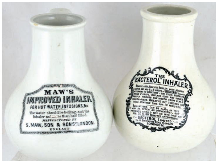
C48. PAIR OF ALL WHITE inhalers each with black transfer. 1. Maws - 8 lines of writing. (Rare). Each has outer border & rear spout. (2) (GM)