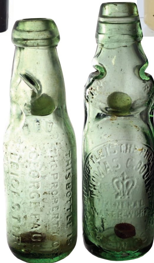
C42. PAIR OF CODDS, aqua glass. 1. 'George Paul/ Leicester' patent 4 narrow neck. 2. Thomas Goodin/ Great Wigston' Reliance patent pict. t.m. Good.