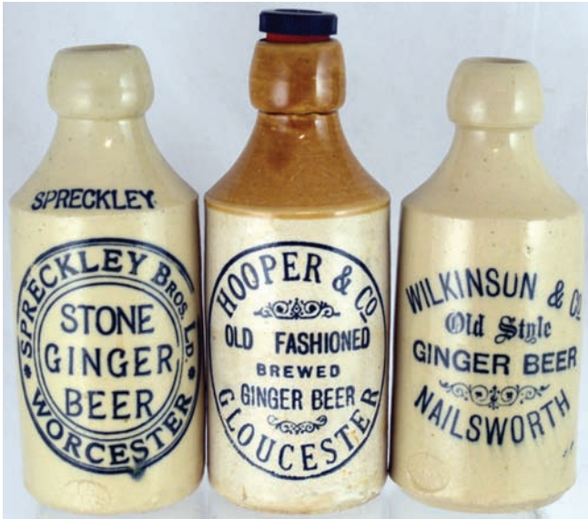
C14. WORCESTER, GLOUCESTER & NAILSWORTH g.b. trio. 1. SPRECKLEY BROS all white, std. 2. Hooper & Co, std, t.t. 3. Wilkinson & Co, all white, std. (3)