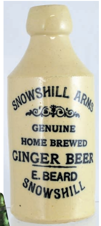
C41. SNOWSHILL ARMS all white, std, g.b. Price p.m. Very good. (CM)