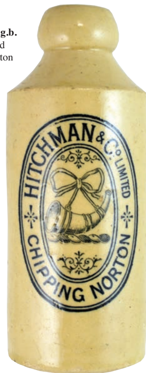
C31. CHIPPING NORTON all white, std, g.b. 'Hitchman & Co/ ...' Fabulous highly detailed crisp black transfer - hunting horn pict. Doulton p.m. Very good.