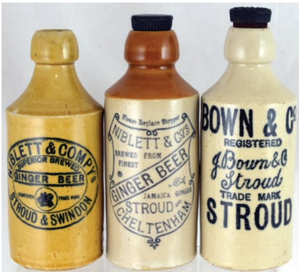
C15. STROUD & area g.b trio. 1. Niblett & Co/ Stroud & Swinton, std, tan. 2. Niblett variant from Stroud & Cheltenham, std, t.t. 3. 'Bown & Co' std, all white.