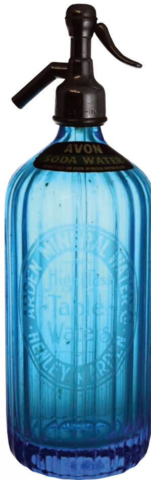
C59. HENLEY IN ARDEN mid blue glass soda syphon. Vertical body ribs. 'Arden Mineral Water Co'. All wording acid etched to front. Metal closure, original paper label to shoulder