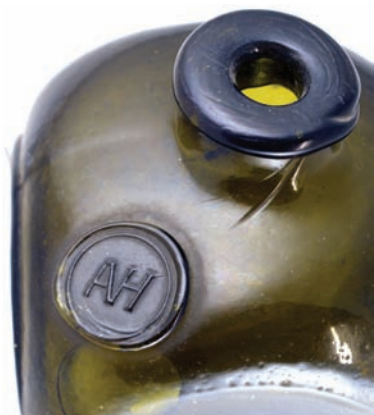
C30. AVH black glass sealed gin. 11ins tall, heavily embossed 2 sides 'Avan Hoboken & Co/ Rotterdam' & 'AVH' shoulder seal. Pig snout lip, crude base. Very good. (CM)