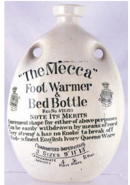
C60. THE MECCA/ FOOT WARMER/ & BED BOTTLE. Flattened oval, all white body green transfer fills to the front, merits, sizes etc. Good. (AB)