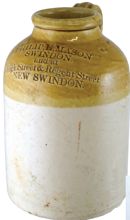
C22. SWINDON FOOD JAR. T.t., rear handle. Shoulder imp'd 'Philip H Mason/ Swindon/ and at/ High Street & Regent Street/ New Swindon'. Some flakes. (JR)