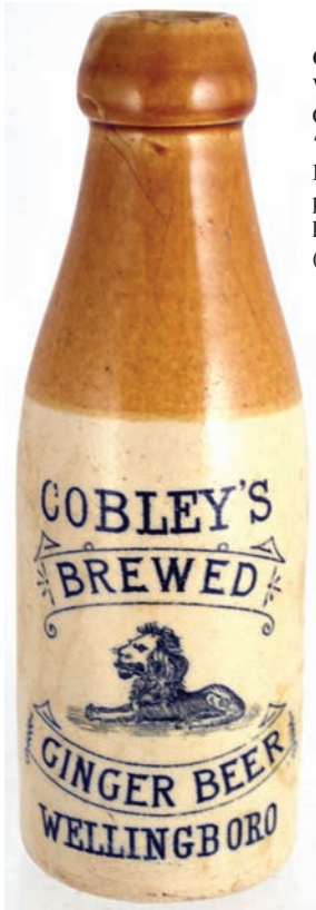
C1. 'COLBEY'S WELLINGBORO'. Ch, t.t., black transfer 'Brewed/ Ginger Beer'. Lrg seated lion pict. t.m. Body hairlines displays well. (NL)

Comm. 15% on hammer - immediate payment taken - we bring items to you. Kick off 'noon 'ish' take approx 40 mins.