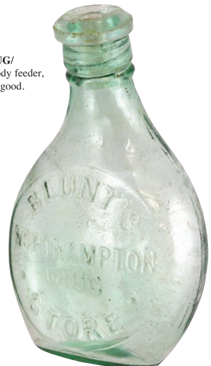
C4. 'BLUNT'S/ NOTHAMPTON/ DRUG/ STORE'. Aqua glass body feeder, internal screw top. Very good.