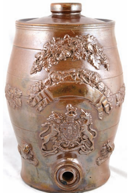
C54. SALT GLAZE BARREL. 14ins tall, overall dark brown colour. Bung hole to front base, filling hole to top. Detailed applied foliate sprigs, curved banner (for contents), coat of arms below, lions either side.