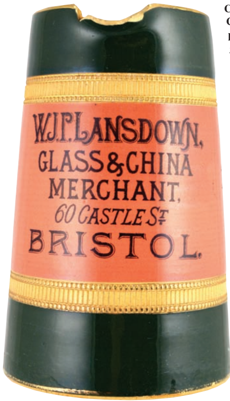
C20. BRISTOL GLASS & CHINA MERCHANT pictorial jug. 6.5ins tall, dark green top & lower with pink central section featuring a black lined transfer. 'WJP Landsdown/ Glass & China/ Merchant/ 60 Castle St/ Bristol'. Some wheeled decoration, rear handle, lip chip. Very rare.