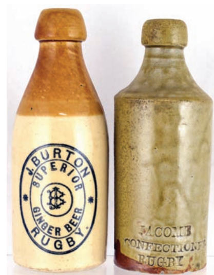
C47. RUGBY DUO. 1. 'J Burton', ch, t.t. g.b. Powell p.m. 2. JA Comb/ Confectioner' grey green slip glaze. Good. (2)