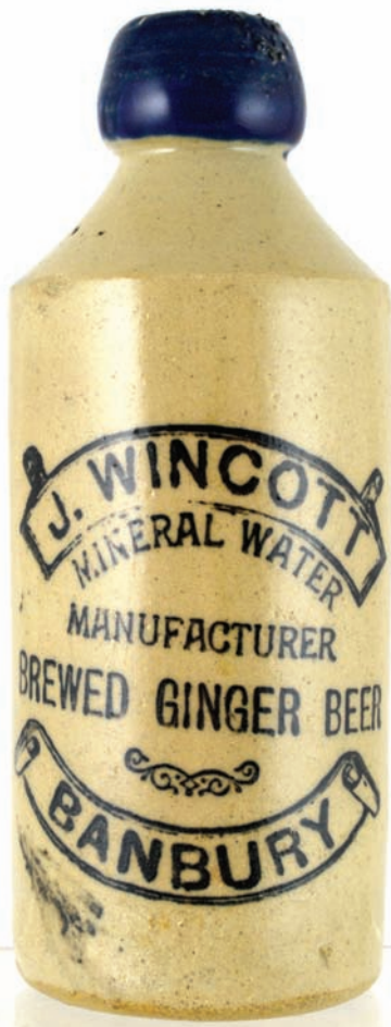
C57. WALLINGFORD/ BREWERY/ LIMITED g.b. All tan, std, black transfer. Galtee More Patent. Very good.