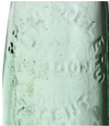
C23. SWANSEA & LLANELLI. Barrett & Elers. Aqua 9.25ins tall. Very heavily embossed Hansards bottle, 'Patent' to rear, 'Lumb & Co Makers' around base. Absolutely stunning condition. (GM)