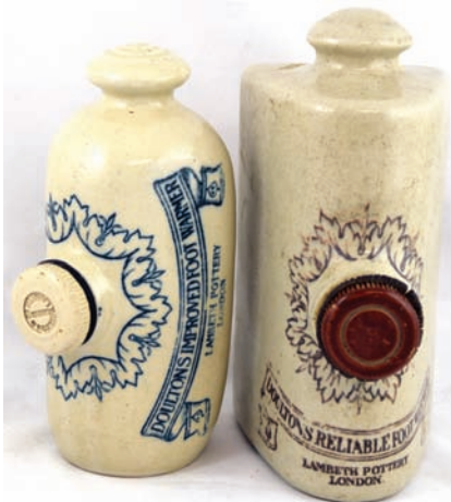
C56. DOULTON FOOTWARMERS. Tallest 10ins - a sepia print 'RELIABLE' other an improved - original stopper. (2) (GM)