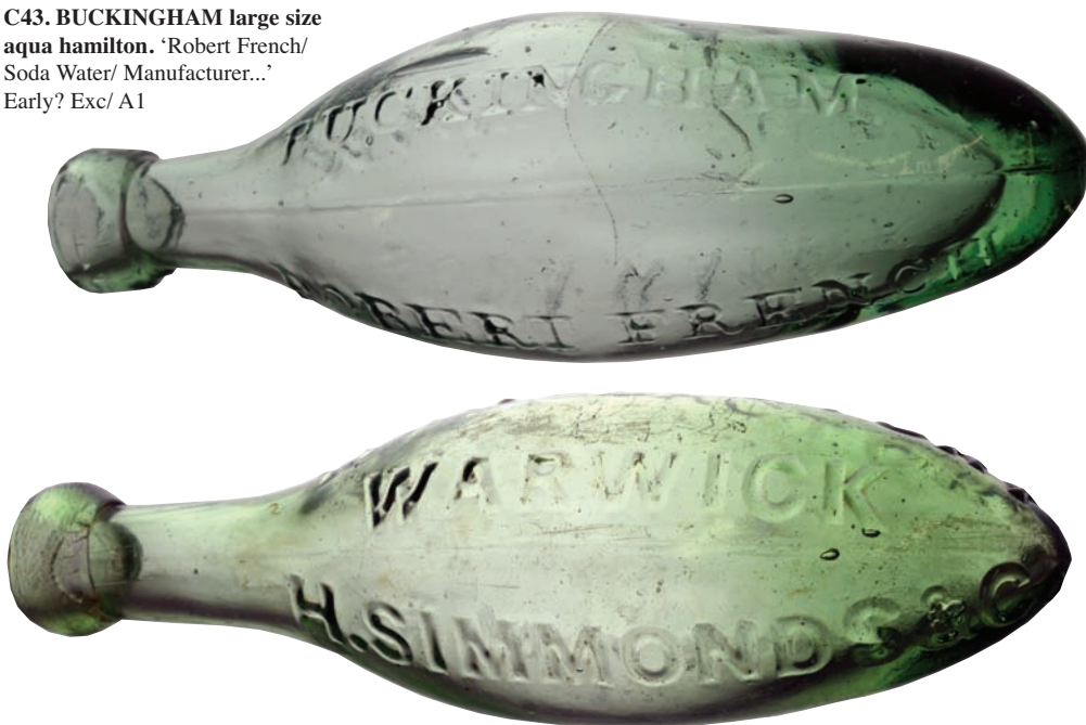
C43. BUCKINGHAM large size aqua hamilton. 'Robert French/ Soda Water/ Manufacturer...' Early? Exc/ A1