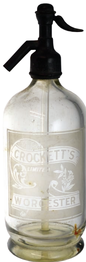
C34. WORCESTER clear glass soda syphon. 'Crocketts ...'. Acid etched front with some additional decoration. Very good.