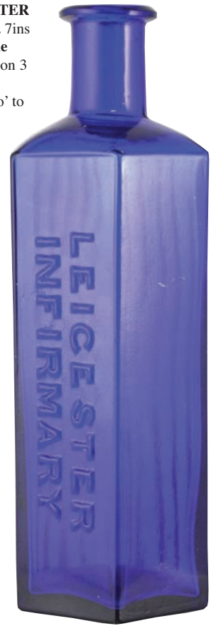
C16. LEICESTER INFIRMARY. 7ins tall, cobalt blue hexagonal poison 3 sides vertically ribbed. 'YG Co' to base. Exc/ A1.