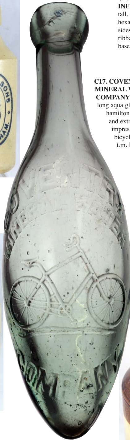
C17. COVENTRY MINERAL WATER COMPANY' 9.5ins long aqua glass hamilton. Large and extremely impressive bicycle pict. t.m. Exc/ A1