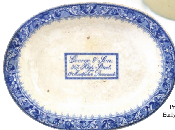
C19. CHELTENHAM change dish. Early blue & white transferred oval dish 'George & Son/ 367/ High Street/ and/ 19 Montpellier Promenade'. Minor staining. Early, good. (JR)