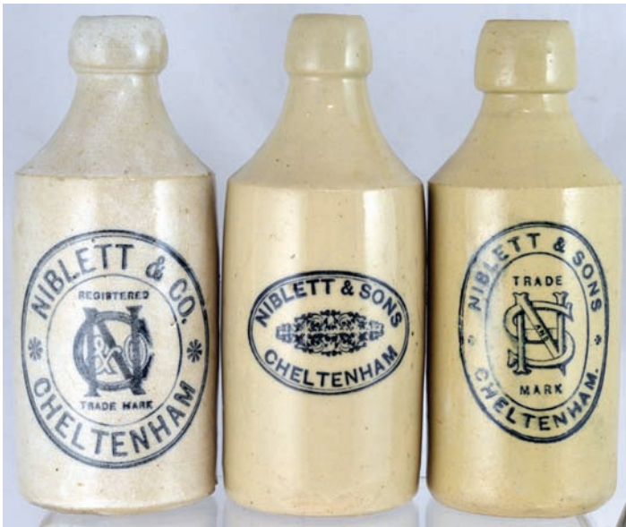
C13. CHELTENHAM G.B. TRIO. All a.w., std. Vairant g.b's from Niblett & Co. (3)