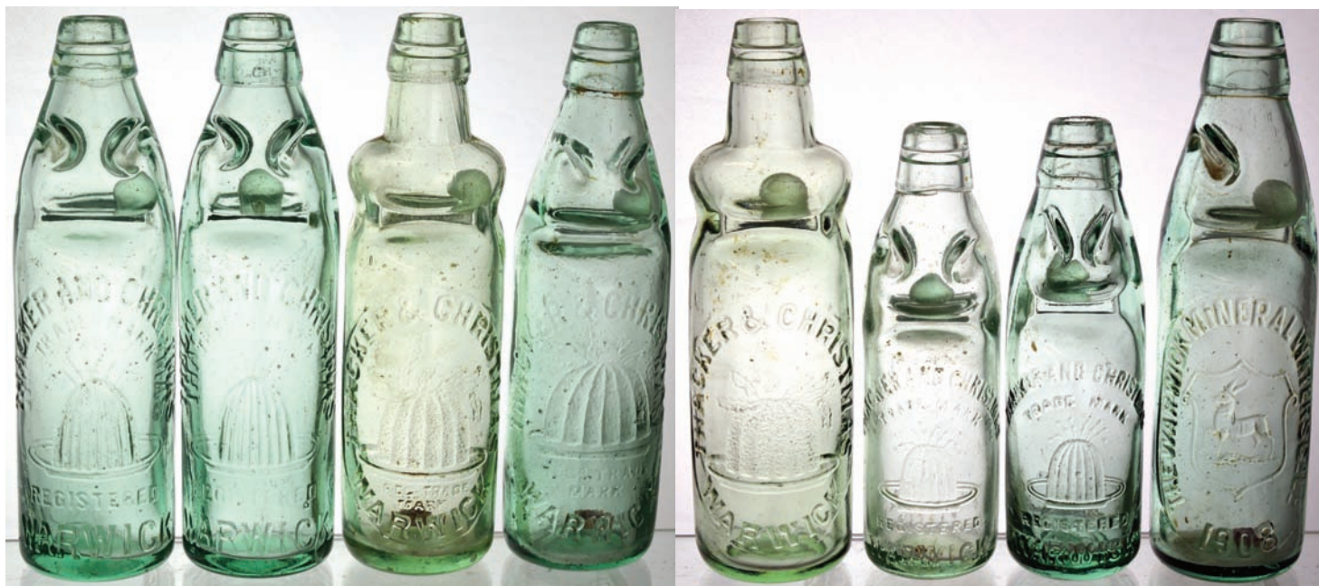
C45. WARWICK aqua coddys group. 7 Thacker & Christmas variations (all with Xmas pud pict. t.m.+ & 1 'Warwick Mineral Water Co/ 1908' deer pict. t.m. Very good.