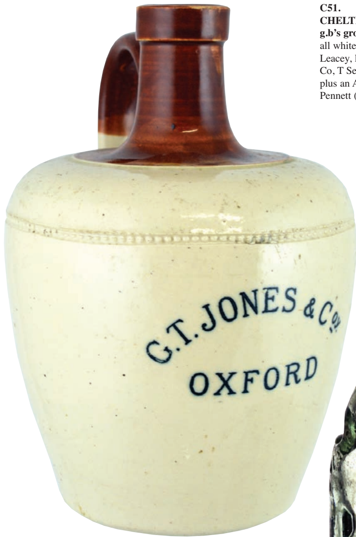
C49. 'GT Jones & Coy/ Oxford' t.t. handled whisky jug. Port Dundas p.m. Possibly the only recorded example? A significant regional rarity offering. Minor lip flakes.