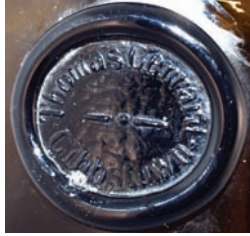
C36. BLACK GLASS SEALED WINE. 11.2ins tall, flattened oval form with short neck. Front applied seal 'Thomas Gerrard/ Gibbstown' (Ireland). Delightful offset seal placement. Very good. (CM)