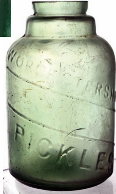
C9. 'WORCESTERSHIRE/ PICKLES'. 6ins tall, shapely aqua glass jar. Overall dull & some damage - early/ unusual/ rare?