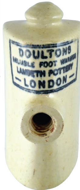
C10. DOULTONS/ RELIABLE FOOTWARMER/ LAMBETH POTTERY/ LONDON'. Heavy black transfer. (GM)