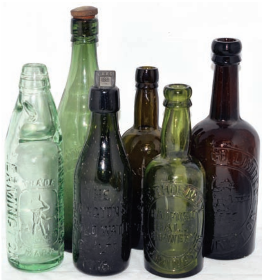
C50. LEAMINGTON minerals group. 1 codd & 5 beer types in black to dark green glass (8)