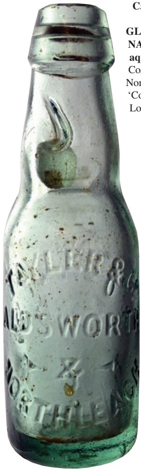
C5. GLOUSTERSHIRE NARROW NECK aqua codd. 'Taylor & Co/ Aldsworth & Northbeach'. To rear 'Codd's/ Patent/ 16/ London/ SE'. (GM)