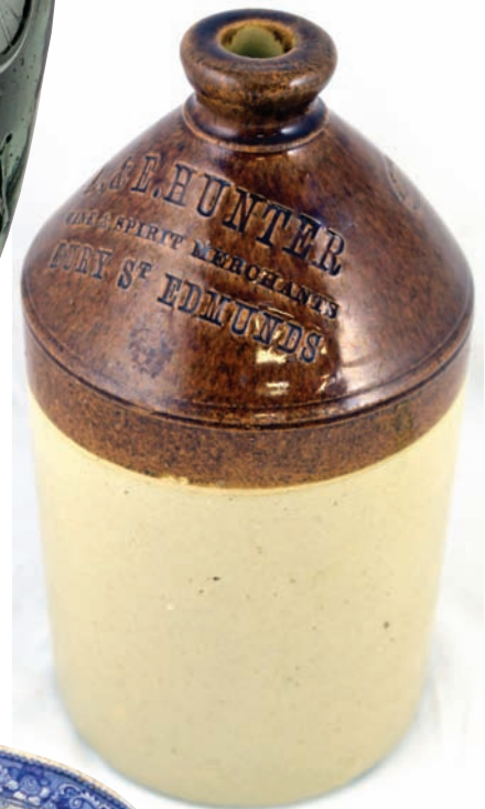
C18. BURY ST EDMUNDS t.t. (dark brown top) half galon flagon. Shoulder imp'd 'A & E Hunter/ Wine & Spirit Merchant...' Doulton p.m. to rear shoulder. Very good. (CM)