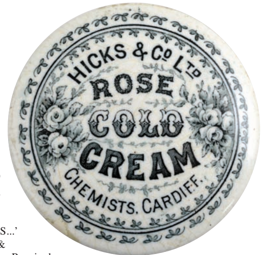
C3. CARDIFF POT LID. 3ins diam, with base. 'HICKS & CO LTD/ ROSE/ COLD CREAM/ CHEMISTS...'. Ornate outer border & rose adornment within. Repaired flange to L side.