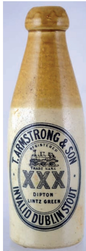
31. T ARMSTRONG & SON/ XXX/ DIPTON/ LINTZ GREEN/ INVALID DUBLIN STOUT. Ch, t.t. cork closure. Oval transfer with train pict. to centre. buchan p.m. Very good (KB)