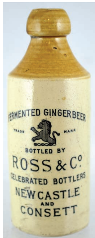
48A. ROSS & CO/ NEWCASTLE/ CONSETT g.b. Std, t.t., infilled lion rearing pict. t.m., 8 lines of writing. Buchan p.m. (KB)