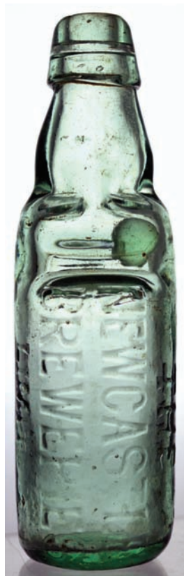
19. NEWCASTLE 'ODD CODD'? 6oz aqua glass 'THE / NEWCASTLE/ BREWERIES/ LIMITED', Turner & Co Makers Dewsbury. Extraordinary 4 pushed in neck dimples - most unusual. Good (KB)