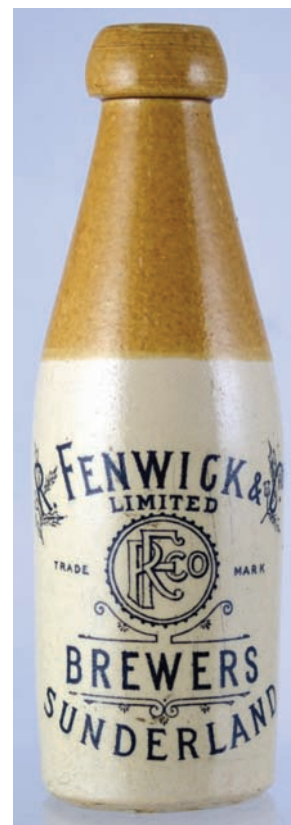
15. FENWICK & CO/ LIMITED/ BREWERS/ SUNDERLAND. Ch, t.t., cork closure. Crisp transfer with thistle embellishment, entwined initials to centre. Buchan p.m. Very good. (KB)