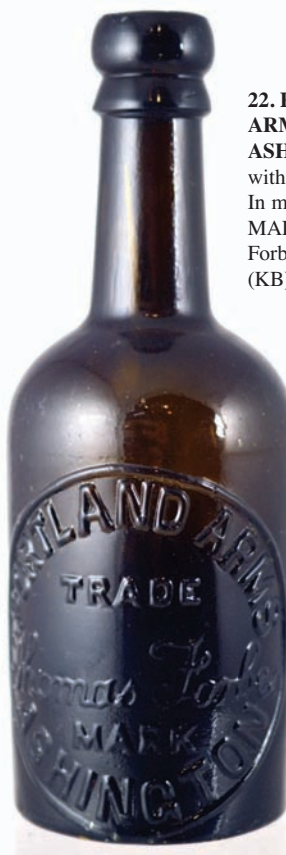
22. PORTLAND ARMS/ ASHINGTON within outer border. In middle TRADE/ MARK/ Thomas Forbes. Very good (KB)