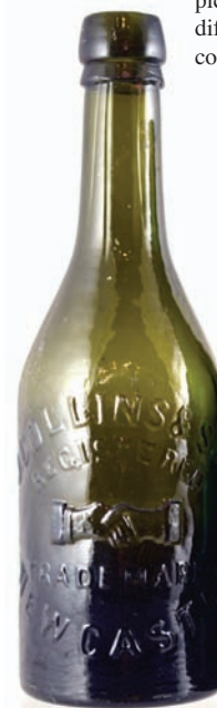
5. J COLLINS & SON/ NEWCASTLE glass beers. One long neck, one standard 1/2 pint ch. shape. both with entwined hands pict. t.m. Two different green colours. (2)