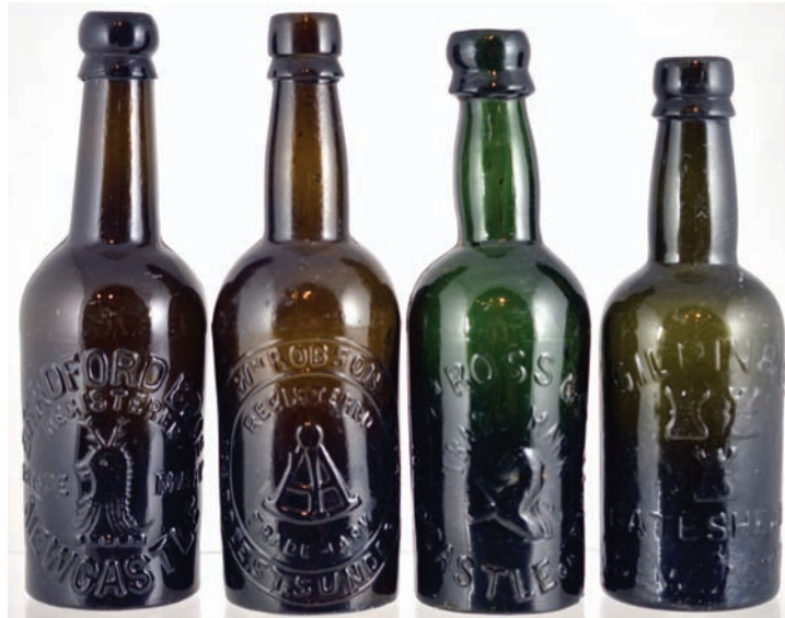
13. BLACK GLASS NORTH EAST PICTORIAL BEERS. All 1/2 pint shouldered style. 1. BRADFORD BROS/ NEWCASTLE - stags head - superb 2. Wm ROBSON SUNDERLAND - sextant pict. Ayers Quay Makers 3. WM Ross & Co/ NEWCASTLE - rearing horse 4. GILPIN & CO/ GATESHEAD & NEWCASTLE - 3 turrets (4)