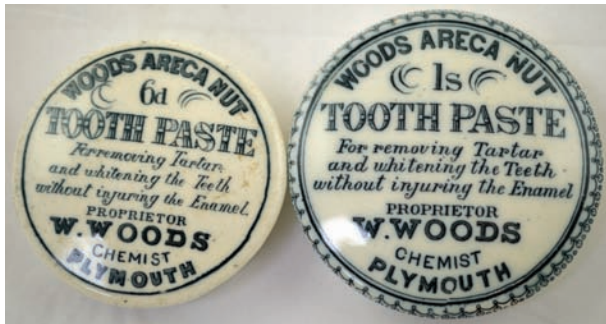
17. PAIR OF WOODS ARECA NUT TOOTH PASTE POT LIDS. One 6d the other 1s size. Decorative outer borders. Both very good (2) (C Mac)