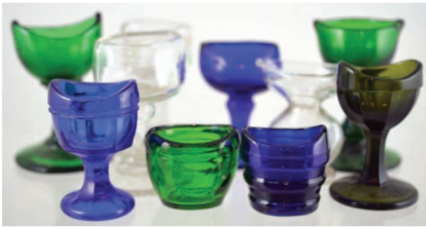
24A. GROUP OF 10 EYEBATHS. Blue, green, clear, stemmed & unstemmed. moulded & freeblown (1) (NL)