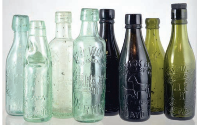
25. MIXED GROUP OF NORTH EAST PICTORIALS 2 of black - Bewick stags, Robson sextant, 2 of green Gilpin 3 turrets, REID & Co hand holding book. 4 of aqua BLACKHILL codd - dray cart, WOOD - Durham cathedral, JESSOP - bridge over river, BLACKHILL - dray cart