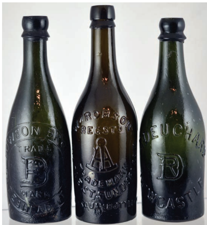
49. TRIO OF NORTH EAST BLACK GLASS BEERS. All elegant long ch. neck types, cork closure 1. DOWSON BROS/ GATESHEAD ON TYNE, entwined initials t.m. 2. WM ROBSON/ SUNDERLAND sextant t.m. Sunderland makers name all around 3. R DEUCHAR/ NEWCASTLE entwined initials t.m. (3)