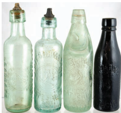
8. J KERSHAW'S GROUP NEWCASTLE & LEADGATE. 3 aqua, 1 black glass. Two upright cylinders, one just Leadgate, 10oz Beavis codd (sick) & a 1/2 pint black glass beer. (4) (KB)

BBR's 2017 'On the Rd' auctions FREE pdf's (& results) from: www.onlinebbr.com Feb 11 Stanley • Apr 9 Cirencester • June 3 Bowburn July 30 Stratford • Aug 9 Exeter • Sept 10 Chessington