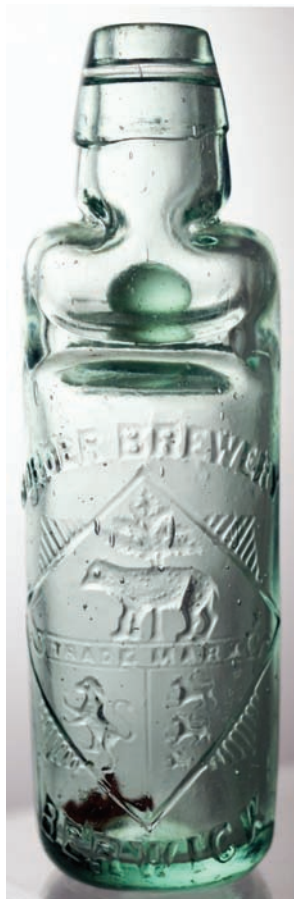
10. BERWICK/ BORDER BREWERY strange bulb neck aqua 6oz codd - very pronounced neck indents? Great pict. trade mark featuring animals. Very good