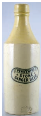
1. R J THURLOW/ DURHAM. All white, taller than normal standard & rear transfer. top section restored. Buchan p.m. (KB)