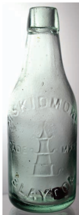
14. A SKIDMORE/ BLAYDON, 6oz (?) aqua glass bullet patent. Unusual shape - fat champagne form. Pagoda pict. t.m. Cleaned (KB)