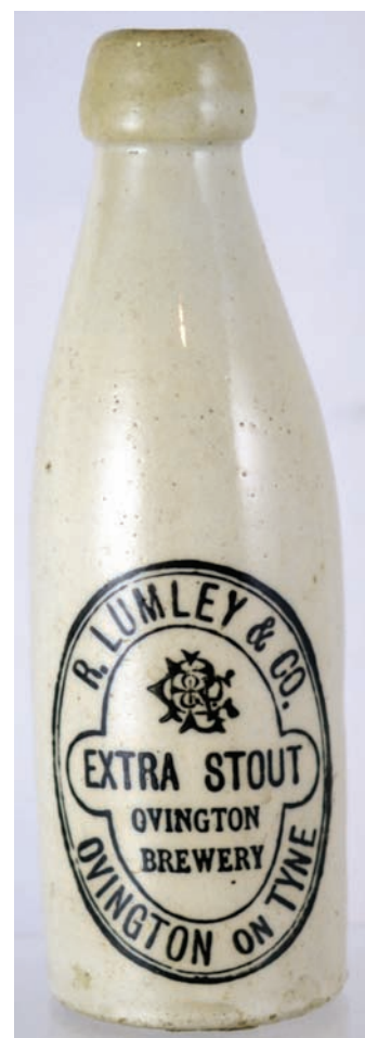
50. R LUMLEY & CO/ EXTRA STOUT/ OVINGTON/ BREWERY/ OVINGTON ON TYNE. Ch. all white, blob top. Strong crisp black transfer. Very good (KB)