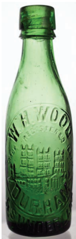
3. W H WOOD/ DURHAM & SUNDERLAND 1/2 pint screw top beer. Heavily embossed with lrg Durham Cathedral pict. Unusually mid bluey green colour. Fantastic (KB)