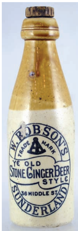
9. W ROBSONS/ YE OLD/ STONE GINGER BEER/ STYLE/ 36 MIDDLE ST/ SUNDERLAND g.b. Ch, t.t., screw top - original turned wood. Buchan p.m Very good. (KB)