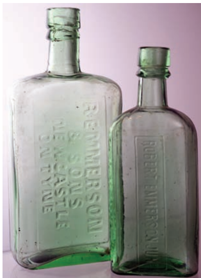
12. R EMMERSON hip flask duo, both aqua. Tallest 7.25ins, flattened rectangular front embossed 'R EMMERSON/ & SONS/ NEWCASTLE/ ON TYNE'. Other curved flask shape - 'ROBERT EMMERSON JUNR' to front. Very good (2) (KB)

ABSENTEE BIDS Absentee bids to be with BBR no later than Thursday prior email: sales@onlinebbr.com