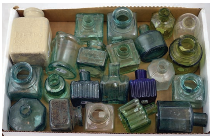
48. MIXED TRAY OF ASSORTED INKS. A good varied selection - coloured, embossed, glass, pottery etc. (22) (CMac)