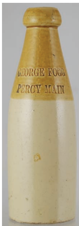
16. GEORGE FOGG/ PERCY MAIN. Ch, t.t., 2 lines impressed heavily to shoulder. Rear base flake. (KB)