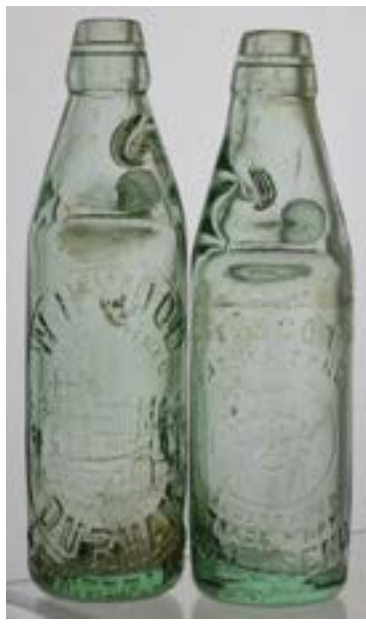
ST2. Pictorial codd duo. Both agua. 10oz W H Wood - cathedral pict. 6oz A T Scott, Wallsend, Father Tyne t.m.