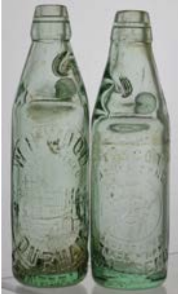
Very good. (2)

ST3. N ELSDON/ DELVES LANE CONSETT stout.