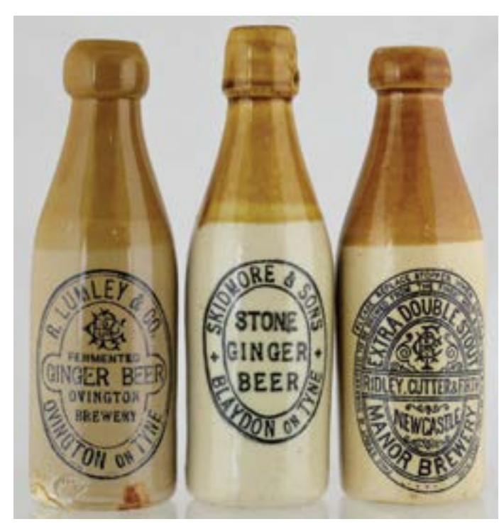
ST9. NORTH EAST GB TRIO. All ch., t.t.: Tallest 8.4ins. 1. R LUMLEY/ OVINGTON ON TYNE. 2. SKIDMORE & SONS/ BLAYDON ON TYNE. 3. RIDLEY, CUTTER & FIRTH/ NEWCASTLE/ MANOR BREWERY. All good.