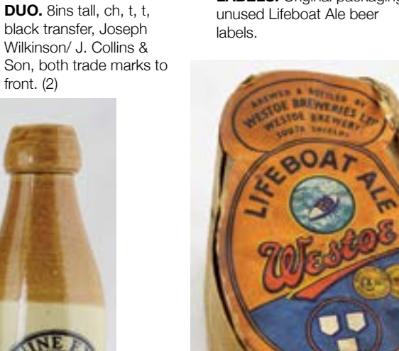
ST40. WESTOE BREWERY LABELS. Original packaging, unused Lifeboat Ale beer