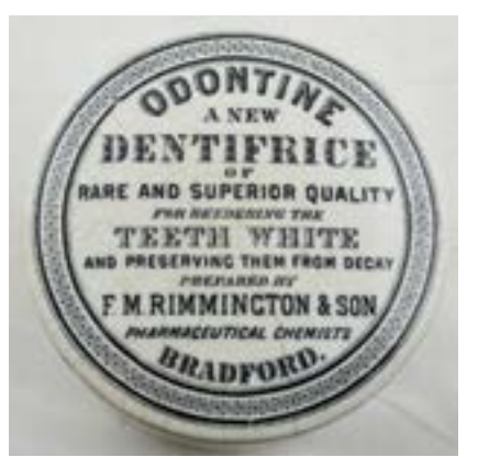
ST33. F. M. RIMMINGTON & SON, BRADFORD POT LID & BASE. 3.25ins diam, black transfer, 12 lines of writing, in need of flange