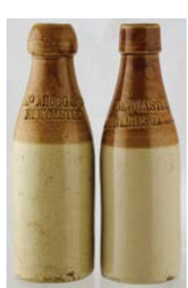
ST18. NEWCASTLE IMPRESSED STONIES DUO. 8ins tall, ch., t.t. Both impressed across the shoulder: 1. GEO HOGG & CO/ NEWCASTLE. 2 NEWCASTLE/ BREWERIES LIMITED. Both |Buchan p.m. (2)

with base. Ornate additions between much of the lettering.