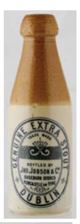
ST1. JNO JOBSON & o/ Ouseburn Stores/ Newcastle on Tyne Stout. 7.8ins tall, ch., t.t. Oval black transfer with decorative borders & entwined JJ initials to centre. Buchan pm. Rear scrape mark otherwise good.

Comm. 15% on hammer - immediate payment taken - we bring items to you. Kick off 'Noon ish' - should take approx 40 mins