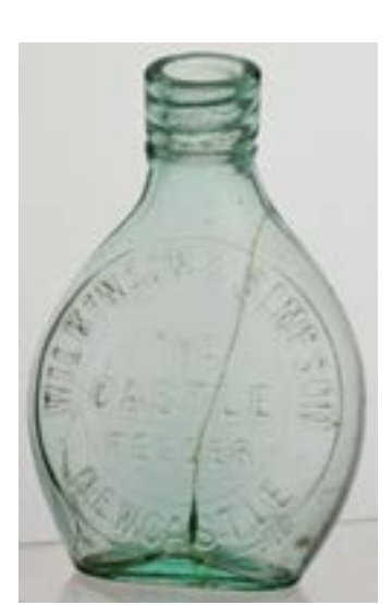
ST12. NEWCASTLE BANJO SHAPED BABY FEEDER. 5.6ins tall, aqua glass. Embossed 'WILKINSON & SIMPSON/ THE/ CASTLE/ FEEDER/ NEWCASTLE.' Int screw stopper. Unfortunately cracked - hopefully find a good home in the North East? (KB)