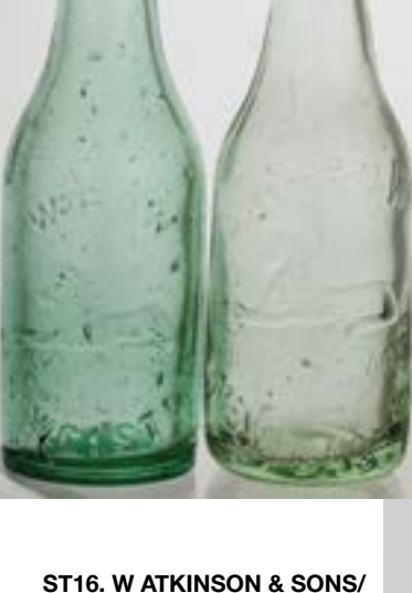
ST16. W ATKINSON & SONS/ HEMSLEY gb. 7.8ins tall, ch., t.t.. All time classic pictorial featuring a strong transfer with central detailed pictorial of Helmsley castle. Buchan pm. Suberb - Exc/ A1.

Pair of stumpy shouldered aqua glass mineral patents (stoppers missing) featuring the seated lion pictorial t.m. embossed between the lettering. One in a distinctive darker hue - of earlier manufacture. Good.