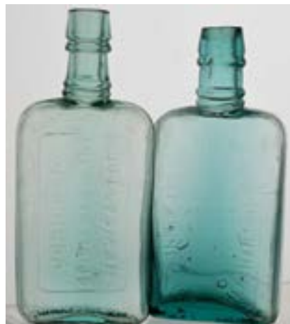
ST19. NORTH EAST HIP FLASK DUO. Tallest 6ins, both flat rounded corners type. 1. W Jackson/ Sunderland/ Shields/ & Newcastle. 2. M Cassidy/ Walker/ Newcastle/ &/ Consett - this a bluey hued agua type.

ST20. NEWCASTLE CODD PATENT. 10oz dark agua glass codd style patent with 2 circular retaining lugs & wooden type vallet stopper. Heavily embossed 'John Baker/ The