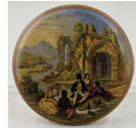
ST27. THE PICNIC multicoloured pratt lid. 4.5ins diam, old English Scene. Chips to