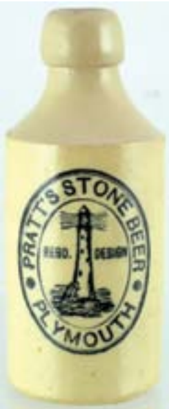
19. PRATT'S STONE BEER/ PLYMOUTH. Std, all white g.b with oval boarded transfer & very large lighthouse to centre. Top section repaired. £64.90 Despite the top repair this great rarity was chased keenly. Nice that it went "home!"