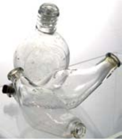
12. BABY FEEDER TRIO. All clear glass. One banjo style THE COMFORT FEEDING BOTTLE (entwined initials to centre), original internal screw stopper. Plus 2 sizes of the double ended 'The/ Allenbury/ Feeder.' Very good (3) £4.72

8.5ins tall, dark aqua mineral cylinder, blob top. Embossed to front 'C C Dornat', t.m of a foliate tree to centre. All heavily embossed. Very good. (GM) £1.18