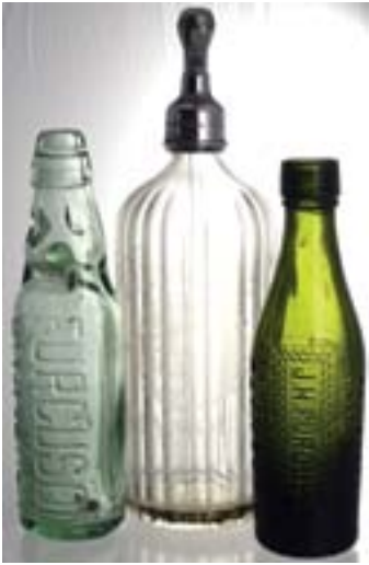
14. FERGUSONS/ PLYMOUTH TRIO. 1. Clear glass vertically ribbed soda syphon. 2. Aqua glass 10oz codd - vertically embossed. 3. Green glass half pint heavily embossed beer. Good. (3) (GM) £11.80