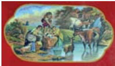
29. PRATT TYPE MULTICOLOURED RECTANGULAR DISH (KM 521 The Torrent) 10 x 7.25 ins. Facetted corners, heavy & ornate gold borders, main body in deep red - orange. Central trefol image of washer woman & cows. Very good. £20.06