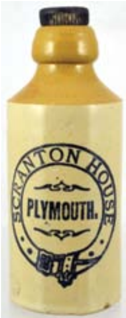
10. SCRANTON HOUSE/ PLYMOUTH, std, t.t, gb. Heavy black transfer - lettering all within buckled belt design. Bourne Denby p.m. Very good. (GM) £14.16