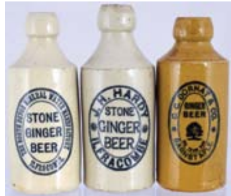
44. DEVON GB TRIO. All std, 2 all white, 1 tan. 1. Noth Devon Mineral Manufactory/ Ilfracombe. 2. J H Hardy/ Stone/ Ginger/ Beer/ Ilfracombe. 3. CC Dornat & Co/ Barnstaple, tree t.m. (3) (CM) £29.50