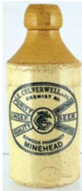
38. MINEHEAD GB std, t.t. Bordered circular transfer 'E CULVERWELL/ APs/ CHEMIST & Co/ EXMOOR PHARMACY. Radiating spoke like wording from central initials coat of arms t.m. Good £49.56 Quite a scarce gb apparently!