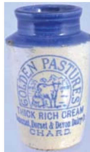
42. BLUE TOP BLUE TRANSFER CREAM POT. 4.1 ins tall. GOLDEN PASTURES/ .../ Somerset Dorset & Devon Dairy Co/ CHARD. Idyllic central pict t.m. of milkmaid & cow. Minor flakes. £20.06