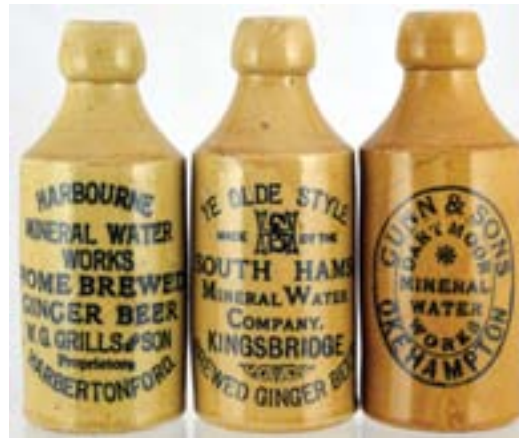
47. DEVEN ALL TAN GB TRIO. 1. HARBORNE/ W G GRILLS & SON/ HARBERTONFORD. 2. SOUTH HAMS/ MINERAL WATER/ COMPANY/ KINGSBRIDGE. 3. GUNN & SONS/ OKEHAMPTON. Some damage. (3) £17.70