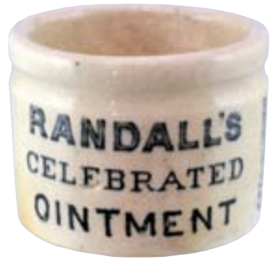
36. RANDALL'S/ CELEBRATED/ OINTMENT. Small 1.25 ins tall pot, transferred all round. SOLE PROPRIETORS/ BREEZE, JACKSON & GREEN LTD/ PLYMOUTH. Some minor crazing, generally very good. Scarce small size. (IM) £47.20