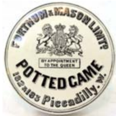
35. FORTNUM & MASON LIMITED/ POTTED GAME/ 182 & 183 PICCADILLY W. Large 4 ins diam pot lid with detailed coat of arms above BY APPOINTMENT/ TO THE QUEEN. Very good. (CMac) £8.26