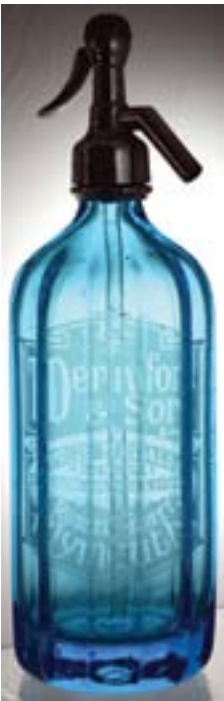
33. PLYMOUTH BLUE GLASS SODA SYPHON. 12ins tall vertically fluted syphon acid etched to front 'Denniford/ & Son/ Ltd' etc - 8 lines ish elaborate format. Small rear ding, otherwise fine. £100.30 Second best performer on the day, staying local - for sure!