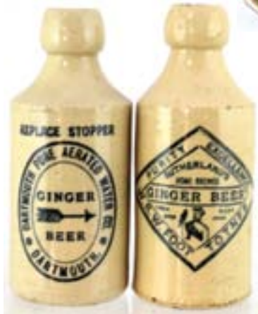
30. DARTMOUTH & TOTNES GB DUO. Std, all white. 1. Dartmouth Pure Aerated Water Co, large arrow pictorial. 2. WRW Foot/ totnes, figure torso pict. t.m. (2) £29.50