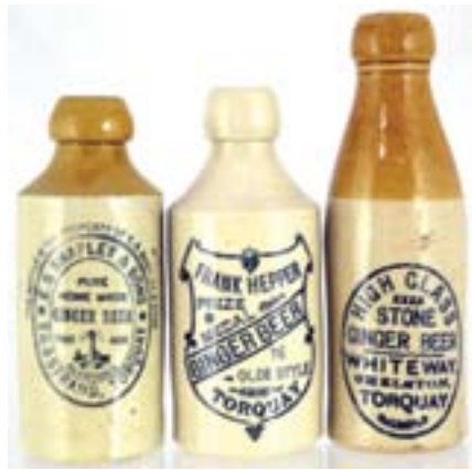
43. TORQUAY GB TRIO. 1. E S SHAPLEY & SONS, lighthouse pict. t.m., std, t.t, 2. All white, std FRANK HEPPER. 3. ch, t.t, WHITEWAY/ CHELSTON. All good. £37.76