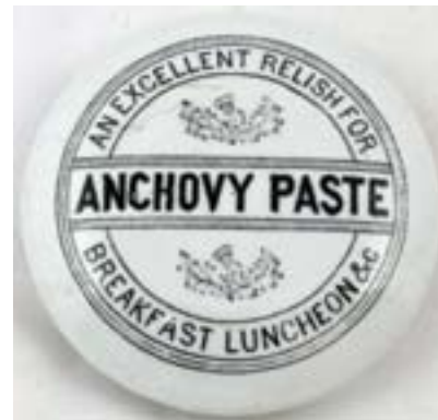
40. ANCHOVY PASTE pot lid. Heavy 4.1ins diam lid 'AN EXCELLENT RELISH FOR/ BREAKFAST LUNCHEON & CO' with thistles above & below centre line. Very good. £2.36