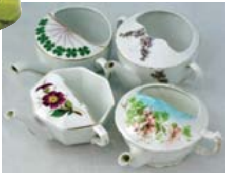
32. MULTICOLOURED TRANSFERED INVALID FEEDERS. All similar shapes, handled, long thin spout. Very colourful. (4) (NL) £5.90