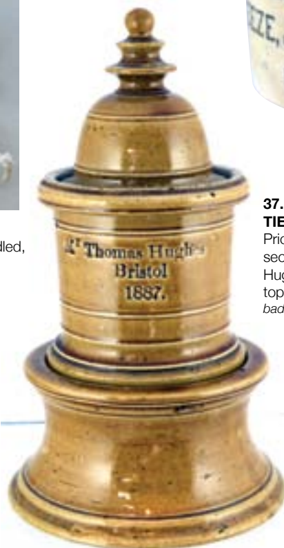
37. DATED BRISTOL THREE TIER TOBACCO JAR. 9.7 ins tall, Price Bristol tan colour glaze, middle section impressed 'Mr Thomas Hughes/ Bristol/ 1887'. Fancy finial top. Very good. (AB) £88.50 Not a bad price - but a quality item all round!