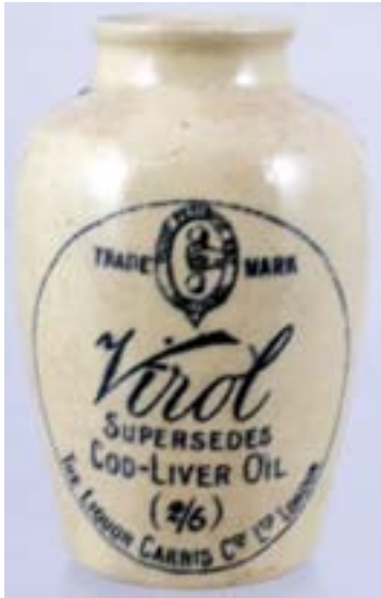
9. SCARCE VIROL JAR - WITH PRICE. 4.7ins tall. A very rarely seen Virol variation featuring the 2/ 6 price above the lowest transferred line. Small lip flake to right side. (CMac) £14.16