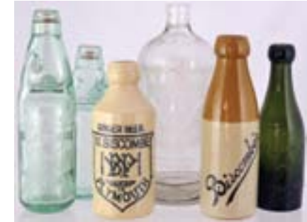
39. W BRSCOMBE PLYMOUTH GROUP. Lge & sml aqua codds, ch, t.t & all white g.g, soda syphon ( acid etched) & small blob top green beer. (6) (GM) £47.20