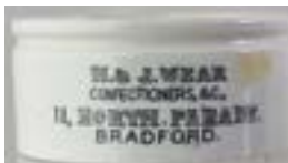
MP142. BRADFORD/ H, & J, WEAR/ CONFECTIONERS... 11, NORTH PARADE. 3.25ins £5.90