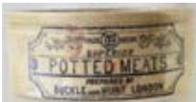
MP136. LONDON/ TRADE MARK SUPERIOR/ ... BUCKLE AND HUNT. 3.25ins, within a border. £25.96