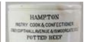
MP143. HAMPTON/ PASTRY COOK & CONFECTIONER... 3ins. £25.96