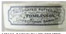
MP129. BARNESLEY/ CELEBRATED POTTED BEEF/ S. TOMLINSON/ CONFECTIONER. 4 x 2.5ins. Within a border, floral pattern to inside. £5.90