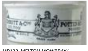
MP133. MELTON MOWBRAY/ TEBBUTT & CO'S... 3.5ins, within a border and trade mark. 18 GOLD MEDALS & DIPLOMAS. £5.90