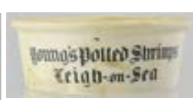
MP149. LEIGH- ON- SEA/ YOUNG'S POTTED SHRIMPS. 3.5ins. £14.16