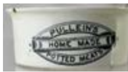
MP137. PULLEIN'S/ HOME MADE/ POTTED MEATS. 3.5ins. £25.96