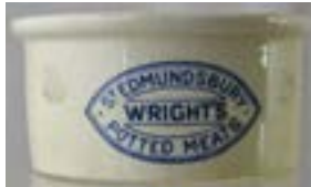
MP131. ST EDMUNDSBURY/ WRIGHTS/ POTTED MEATS. 4ins, blue transfer. £5.90