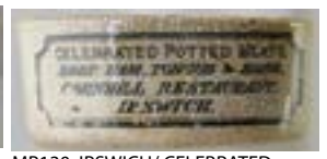
MP130. IPSWICH/ CELEBRATED POTTED MEATS/... CORNHILL RESTAURANT. 4 x 2.5ins. £25.96