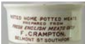
MP126. SOUTHPORT/ NOTED HOME POTTED MEATS/ ... F. CRAMPTON/ BELMONT ST. 3.75ins brown transfer. £5.90