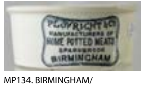
MP134. BIRMINGHAM/ PLOWRIGHTS & CO/ ... SPARKBROOK. 3.5ins. £17.70