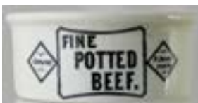
MP141. IPSWICH/ FINE POTTED BEEF/ GENUINE/ R. SEAGER. 3.5ins. £14.16