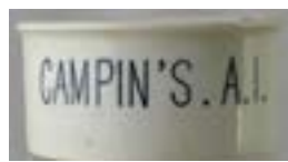
MP127. CAMPIN'S. A. I. 3ins. £14.16