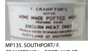
MP135. SOUTHPORT/ F. CRAMPTON'S/... PORTLAND ST. 3.5ins, brown transfer. £5.90