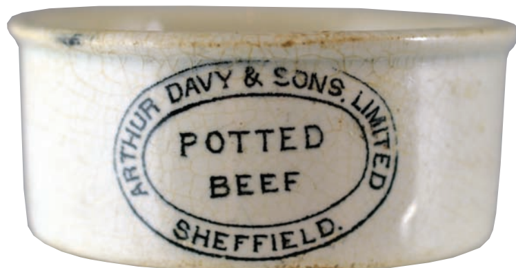
Above: Second highest performer in this offering was this Sheffield pot @ £41.30.

In total this initial offering of 40 meat paste pots made £750,