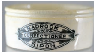
MP18. RIPON/ BADROCK. 3.1ins diam, 3 lines in heavy oval bordered shape. £11.80