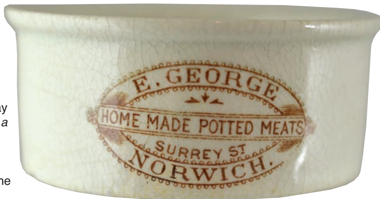
Above: Top meat pot from the first 40 offered was this sepia print Norwich example - £67, just a little less than the bidders ceiling.