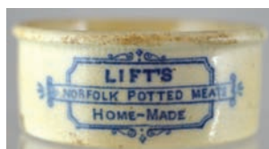
MP37. LIFTS/ NORFOLK. 3.5ins diam, blue transfer, 3 lines within decorative boxes. Minor staining. £37.76