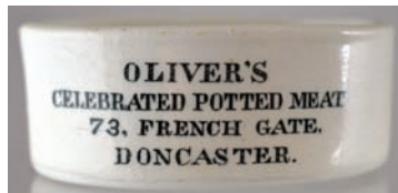
MP22. DONCASTER/ OLIVERS. 4ins oval, 4 lines writing. Very good. £23.60