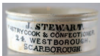
MP2. SCARBOROUGH/ J STEWART. 3.3ins diam, 4 lines. To rear THE MIKADO. Some staining, small lip flake. £11.80