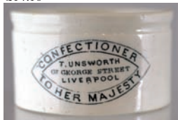
MP29. LIVERPOOL/ T UNSWORTH. 3ins diam, 5 lines, 2 written within point edged border. Tiny real lip flake. £14.16