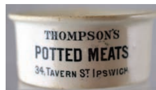
MP3. IPSWICH/ THOMPSONS. 3.5ins diam, 3 lines. Very good. £8.26