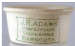
MP1. BARMOUTH/ JR ADAMS. 2.5ins diam, circ. Hairline to left side. Green print. £17.70