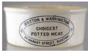
MP25. BUXTON/ BRITTON & WARRINGTON. 3.3ins diam. In bordered oval transfer, 2 lines in middle. Side rim knock. £14.16