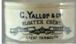
MP14. GREAT YARMOUTH/ G YALLOP. 3.6ins diam, 4 lines, one in decorative banner. Exc/A1. £17.70