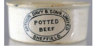
MP16. SHEFFIELD/ ARTHUR DAVY. 3.5ins diam. Oval border, 2 lines in centre. Good. £41.30