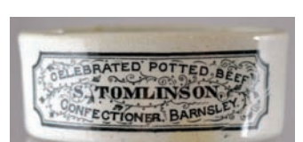
MP36. BARNSELY/ S TOMLINSON. 4ins diam, 3 lines writing all within highly decorative box. Good solid piece. £20.06