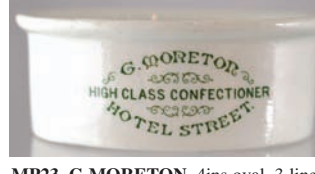
MP23. G MORETON. 4ins oval, 3 lines & decorative 'bits' all in green transfer. Very good. £37.76