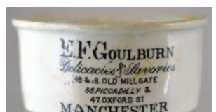
MP35. MANCHESTER/ E F GOULBURN. 3.5ins diam. 6 lines of writing. Very good. £11.80