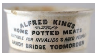
MP5. TODMORDEN/ ALFRED KINGS. 3.2diam, 4 lines. Some rust staining. £14.16