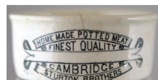
MP34. CAMBRIDGE/ STURTON BROTHERS. 3.3ins diam, 4 lines separated by detailed border. Very good. £25.96