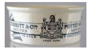
MP38. TEBBUTT/ MELTON MOWBRAY. 3.5ins diam. Curve edged banner around lettering, coat of arms to centre. Exc/ A1 £11.80