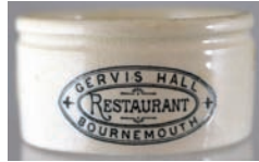
MP10. BOURNEMOUTH/ GERVIS HALL. 3ins diam. 2 lines in oval border, RESTURANT in middle. Very good. £8.26