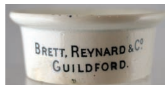
MP7. GUILDFORD/ BRETT REYNARD & CO. 3.7ins diam, 2 lines. Very good. £11.80