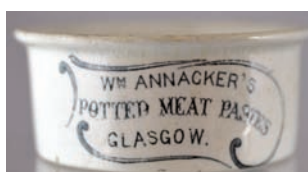
MP31. GLASGOW/ WM ANNACKER'S. 3.5ins diam, 3 lines within wavy edged border. Rear rim flake. £14.16