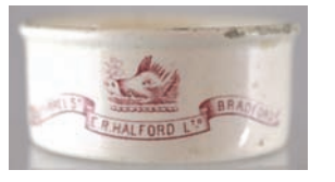
MP39. BRADFORD/ E R HALFORD LTD. 3.5ins, red print lettering in banner, hogs head above. rear crack. £37.76