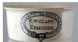
MP6. EXMOUTH/ FW CLAPP. 3.3ins diam. In buckled belt, 2 lines to middle, lip flake. £17.70

complete with add-ons, averaging almost £19 per pot.