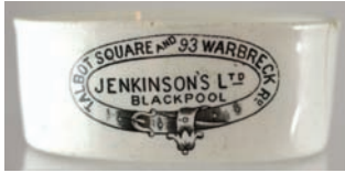
MP13. BLACKPOOL/ JENKINSONS LTD. 3.5ins oval. Strong black transfer in buckled belt. Exc/ A1. £14.16