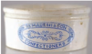
MP21. SEMADINI & SON. 3.1ins diam. Blue transfer lettering oval border, decorative centre. Very good. £14.16