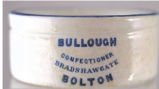
MP17. BOLTON/ BULLOUGH. 3.6ins diam, 4 lines in blue plus blue rim. Hairline. Heavy stoneware. £11.80