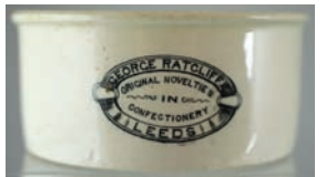
MP33. LEEDS/ GEORGE RATCLIFFE. 4.7ins diam, 5 lines - 2 within elaborate buckled type border, 3 within. Rare large size. Very good. £14.16