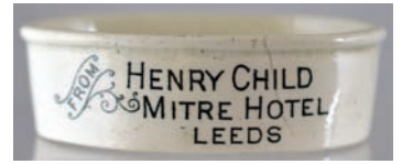
MP12. LEEDS/ HENRY CHILD/ MITRE HOTEL. 3.6ins, oval. Rim hairline. 14.16