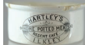
MP15. ILKLEY/ HARTLEYS. 3.2ins diam, 4 lines, oval border. Rim nibbles. £8.26