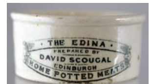
MP30. EDINBURGH/ THE EDINA. 3.2ins diam, 5 lines, 2 within decorative border. Flake bottom left. £14.16