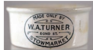
MP26. SOWMARKET/ W A TURNER. 3.3ins diam, 4 lines in oval border. Very good. £8.26