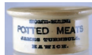
MP4. HAWICK/ JAMES TURNBULL. 3.4ins diam, 4 lines. Stoneware. Exc/ A1 £14.16