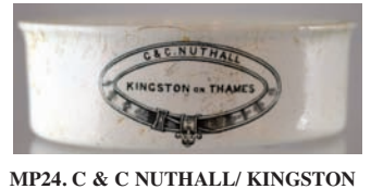
MP24. C & C NUTHALL/ KINGSTON ON THAMES. 4.7ins oval. Lettering in buckled belt. Minor rear flake. Feels/ looks early? £25.96