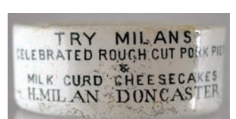
MP32. DONCASTER/ TRY MILAN. 3.9ins oval, 5 lines. Some speckling - superb early (heavy) example. £20.06