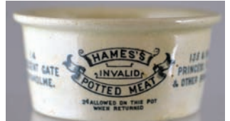
MP28. RUSHOLME/ HAMES'S. 2.7ins diam, 2 lines in decorative banner - 5 lines in total, 3 lines each side. Very good. £20.06