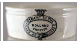
MP8. CHESTER/ BOLLAND. 3.7ins diam. In buckled belt, crown atop, 2 lines in middle. VEAL & HAM to rear. Very good. £20.06