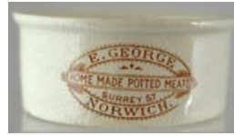
MP11. NORWICH/ E GEORGE. 3.5ins diam, 4 lines, decorative border. Sepia print. Very good. £79.06