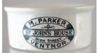
MP20. VENTNOR/ M PARKER. 3.2ins diam, 4 lines. Very strong crisp print. GREEN & CO, green print pictorial base p.m. Good. £14.16