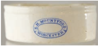
MP9. WORCESTER/ S H MOUNTFORD. Blue print in oval border, 4.1ins diam oval pot. Very good. £14.16