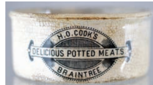
MP19. BRAINTREE/ H O COOKS. 3.3ins diam, 3 lines, very decorative. Overall crazed. £14.16