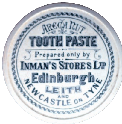
B59. NEWCASTLE ON TYNE pot lid. 'Areca Nut/ Toothpaste/ Prepared only by/ Inman's Stores Ltd/ Edinburgh/ Leigh/ And/ Newcastle on tyne'. Good. (KB) £14.16