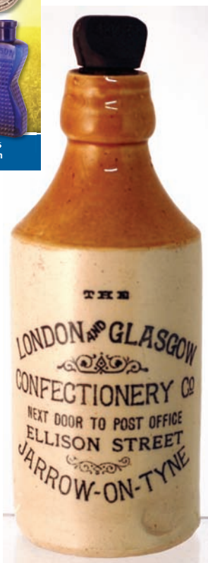
B39. JARROW ON TYNE g.b. Std, t.t. i.s. 'The/ London & Glasgow/ Confectionary Co/ Next Door To Post Office/ Ellison Street...' What a brilliant address? Only 2 known we are told? (KB) £153.40