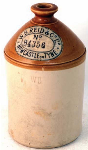
B55. NEWCASTLE ON TYNE FALGON. One gallon, t.t. shoulder with white oval transferred 'WB Reid & Co Ltd/ No/ B4356' within oval. 'WB' impressed below. Buchan p.m. to rear shoulder. Very good. (KB) £35.40