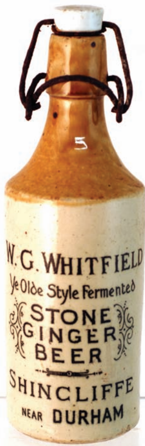
B35. SHINCLIFFE/ NEAR/ DURHAM g.b. Shouldered std, t.t., s.s. (rusted). 'WG Whitefield/ ye Olde Style Fermented/ ...' Full front transfer with decorative embellishments. Buchan p.m. (KB) £35.40