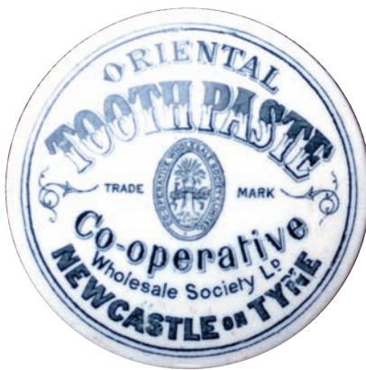
B11. NEWCASTLE POT LID. 'Oriental/ tooth Paste/ Co-operative/ Wholesale Society Ltd...' pict. t.m. to centre. Very strong & crisp transfer. Exc/ A1. (KB) £59.00