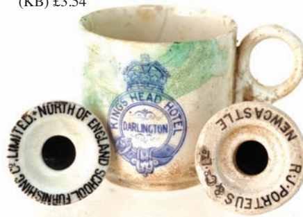
B51. NORTH EAST POTTERY 'bits' trio. two ceramic desk ink inserts - 'R J Porteus & Co Ltd/ Newcastle' plus 'North of England School Furnishing Co Ltd plus blue transferred 'Kings Head Hotel/ Darlington' coffee cup in buckled belt & crown above. (3) (KB) £3.54