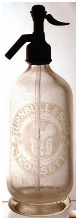
B56. CONSETT soda syphon. Clear glass, etched to front 'Turnbull & Son... cockerel t.m. to centre. All within oval. below 'Syphon Co Ltd London'. Imp'd Turnbull & Son/ Consett' to metal top. Good. (KB) £55.46