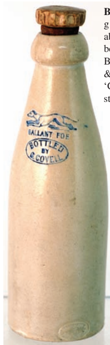
B6. G. COVELL ch, a.w., g.b. Greyhound running above 'Gallant Foe', below that 'BOTTLED/ BY/ G COVELL' - all imp & picked out in blue. 'Covill' imp. stone stopper. (KB) £259.60