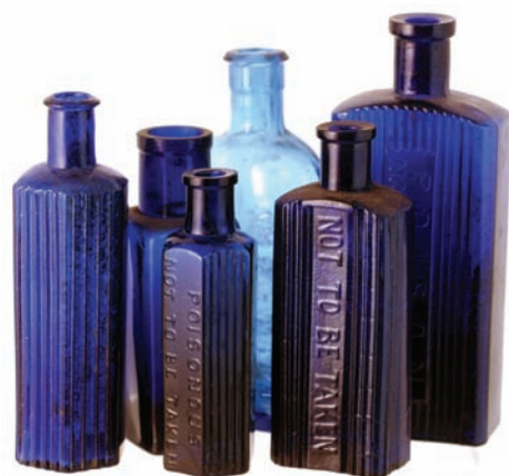
B21. GROUP OF BLUES. Tallest 7ins. Hexagonal (2), retangular (2), square & round shouldered bottle. Good. (6) (KB) £4.72