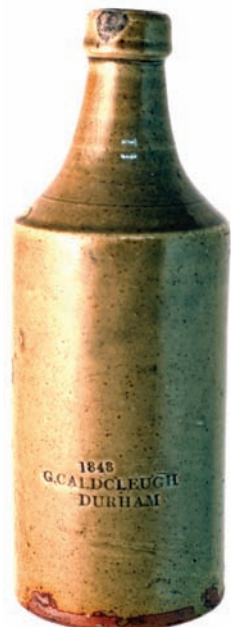
B13. DURHAM DATED PORTER. Grey green slip glaze (Chesterfield made) lrg size porter, 10ins tall. Imp'd toward base '1848/ G Caldcleugh/ Durham'. 2 lip glaze touch marks - sound as a pound! (KB) £20.06