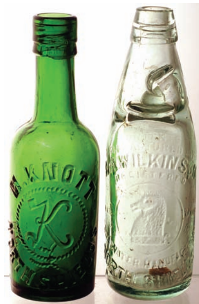
B49. NORTH SHIELDS glass duo. 1. 10oz aqua codd 'WA Wilkinson', large unicorn t.m. to centre. To rear 'JW Dobson/ maker/ barnsley'. 2. Green shouldered type beer heavily embossed 'M Knott' ('K' t.m. to centre). (2) (KB) £1.18