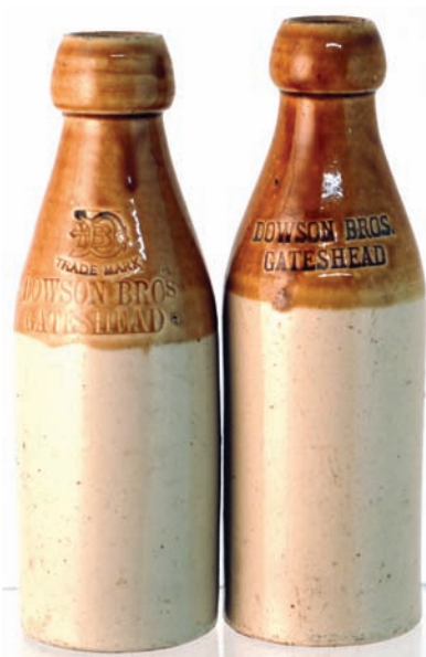
B23. DOWSON BROS/ GATES HEAD pair of impressed ch, t.t. i.s. g.b's. One example features entwined initials t.m. above - Buchan, other Port Dundas. Very good. (2) (KB) £17.70