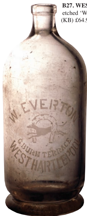
B27. WEST HARTLEPOOL clear soda syphon, acid etched 'W Everton/ 6 Burn Terrace'. Some body wear. (KB) £64.90