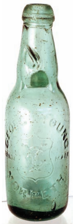
B19. MORPETH narrow neck codd. 10oz aqua. Front 'George Young', entwined initials within shield. To rear 'Codd's/ Patent/ 4/ London/ SE.' Base embossed 'B Rylands... Ardsley...'. Cleaned. (KB) £84.96