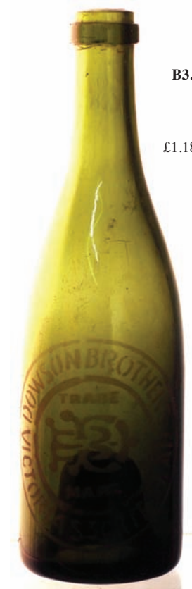
B3. GATESHEAD ACID ETCHED bottle. 9.5ins tall, dark green, ch, thick string lip. 'Dowson Brothers/ victoria St' entwined initials within an oval border. Good. (KB) £1.18