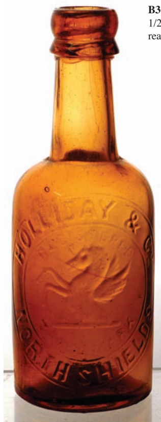
B36. NORTH SHIELDS beer. Shouldered type, 1/2 pint, golden amber. 'Holliday & Co', large rearing horse pict. t.m. Very good. (KB) £53.10