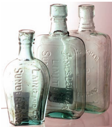
B45. SUNDERLAND hip flasks trio. All aqua glass, tallest 6ins, 1. 'James Deuchar...' written vertically. 2. 'James Deuchar...' written horizontally. 3. 'Laing & Co...' written vertically. Very good. (3) (KB) £7.08