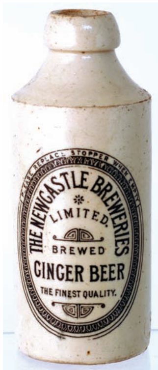
B37. THE NEWCASTLE BREWERIES g.b., std, all white, i.s. Upright oval transfer with decorative outer border etc. Buchan p.m. Very good. (KB) £37.76