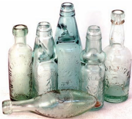
B47. MINERALS GROUP. All aqua. 'R Thompson/ Bishop Auckland' bird pict. 6oz hamilton plus coddles from North Shields, Higginbottom/ Newcastle/ Sunderland, Alexander/ Newcastle bulb neck + 2 others. (6) (KB) £31.86