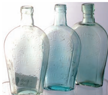
B8. SOUTH SHIELDS hip flask trio. 5.8ins tall, all aqua to bluey aqua. 1. W. Jackson. 2. W Roseburgh/ Neville hotel. 3. T Lauderdale/ Golden Lion Hotel. All good. (3) (KB) £20.06

Tried • Tested • Trusted www.onlinebbr.com more sales... more often