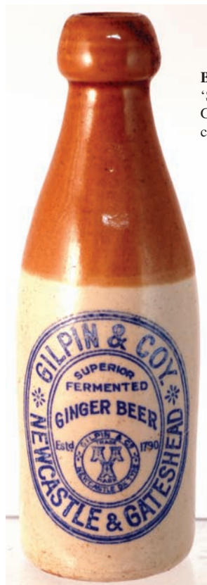
B1. GILPIN & COY ch, t.t., blue transfer g.b. 'Superior/ Fermented/ Ginger Beer/ Newcastle & Gateshead'. Large oval transfer with 3 turreted castles t.m. Gray p.m. Very good. (KB) £94.40

Kicked off @ noon 'ish - take approx 30+ mins.