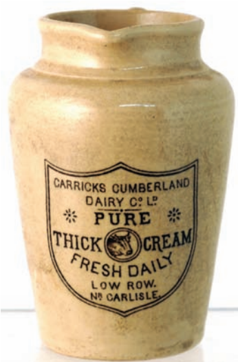
B22. CARLISLE cream pot. 4.75ins tall. Off white, rear handle. 'Caricks Cumberland/ ... Loe Row...' Pict. t.m. to centre, all within shield border. Very rare in this size. Very good. (KB) £43.66

ABSENTEE BIDS Absentee bids to be with BBR no later than Thurs. 5th Sept or email: sales@onlinebbr.com