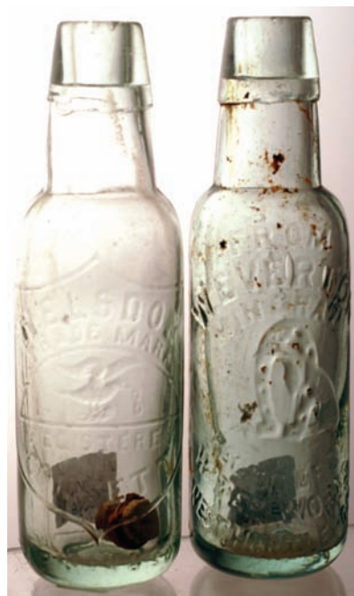
B25. NORTH EAST pair of 6oz bullet stoppers: 'N Elsdon/ Consett' bird pict. t.m. plus 'W Everton/ West Hartlepool' seated dog & horseshoe pict. t.m. (2) £9.44