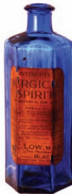
B42. BLACKHILL labelled poison. Cobalt blue hex, 6.25ins tall, ribbed 3 sides, indecipherable base mark? Partial original label '...Surgical/ Spirit... Low MPS/ The Pharmacy/// Black hill'. (KB) £2.36