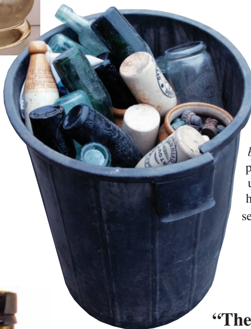
B61. THE STAR LOT. Straight from Kevins shed, we haven't looked inside - so no idea what's in there! We forgot to bring this lot up last year! Full plastic dust bin - plenty of unwashed mullock/ quality/ hidden gem. NO ROOTING - as seen! A lot? (KB) £84.96