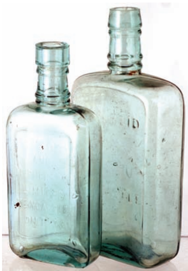
B2. NEWCASTLE hip flasks duo. Aqua glass, tallest 7ins. 1. 'John Reid/ Spirit Merchant'. 2. 'Simpson and McPherson'. Very good. (2) (KB) £1.18