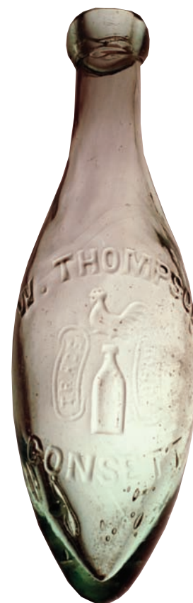
B24. CONSETT hamilton. 10oz aqua glass, 'W Thompson' with large pict. of bird on bottle t.m. Very good/ clean. (KB) £177.00