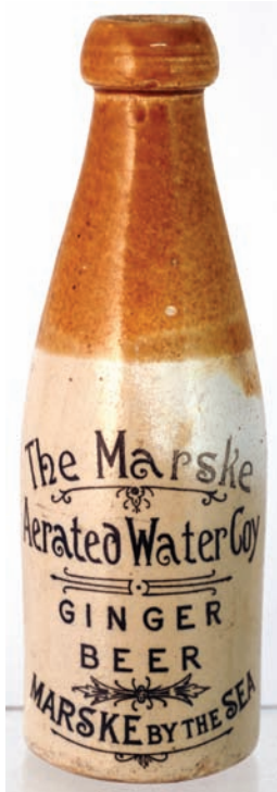
B9. MARSKE BY THE SEA ch, t.t., g.b., int screw. 'The Marske/ Aerated Water Co...' No damage but right side has a white area. Buchan p.m. (KB) £35.40