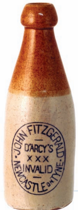
B18. NEWCASTLE ON TYNE g.b. Ch, t.t. cork. 'John Fitzgerald/ D'Arcy's/ XXX/ Invalid...' Very good. (KB) £4.72

Before bidding please ensure items meet your condition requirements - INSPECT! On sale day ALL items sold AS SEEN - NO RETURNS