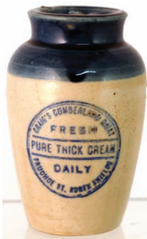
B4. NORTH SHIELDS cream pot. 4.3ins tall, blue top blue transfer. 'Craigs Cumberland Diary/ ... Prudhoe St, North Shields' oval outer border. Couple of lip flakes otherwise good. £64.90