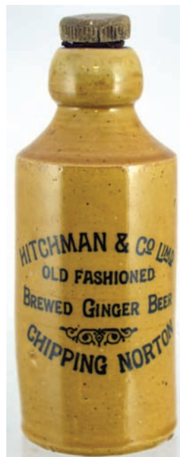
W18. HITCHMAN & CO Lind/ Old Fashioned/ Brewed Ginger Beer/ Chipping Norton. T.t., std, all tan. POWELL/ BRISTOL P.M. Very good