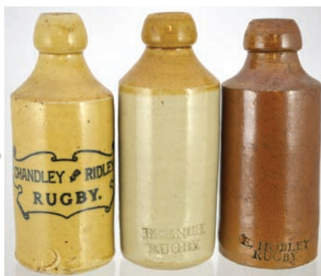
W41. 'CHANDLEY/ AND/ RIDLEY RUGBY' g.b. , std all tan. Plus 2 others 'FRENCH/ RUGBY' imp'd 2 lines to lower. Plus a salt glaze example 'E Hobley/ Rugby'. All good (3)