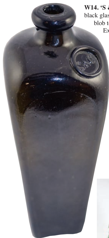
W14. 'S & G' sealed gin. Typical case shaped black glass gin tapering to a narrow base. Lovely blob top lip & very crisply struck shoulder seal. Exc/ A1. Never seen this one before? (CM)