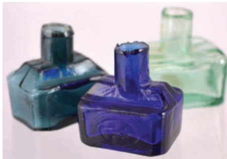
W48. BOAT INKS TRIO. Smallest is 2 x 1.5ins & cobalt. Largest is aqua, medium is turquoise blue. Very good (MH)