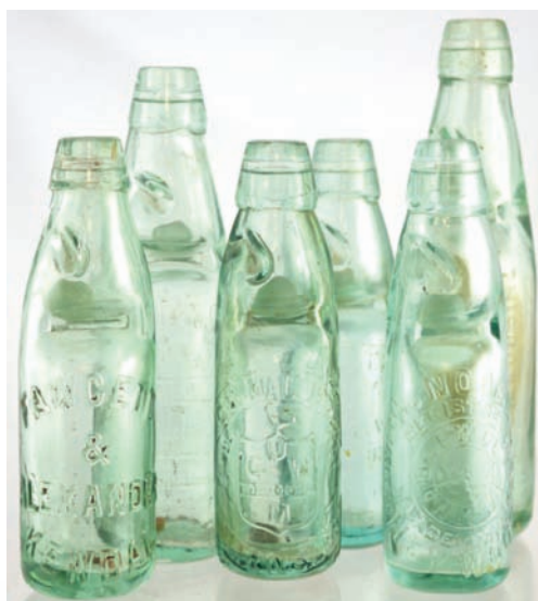
W15. GRP OF 6 AQUA CODDS. 4 @ 6oz, 2 @ 10oz. Stalybridge, Huddersfield, Kendal, Barnsley, Heywood & Elland (label to rear). Good (6)