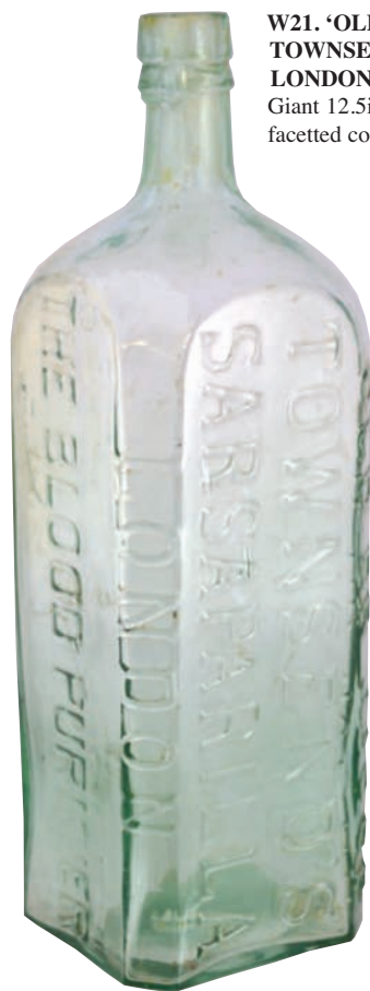
W21. 'OLD DR JACOBS/ TOWNSENDS/ SARSAPARILLA/ LONDON/ THE BLOOD PURIFIER'. Giant 12.5ins tall, aqua glass square bse, faceted corners. Rare & impressive