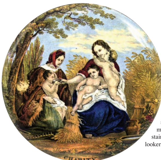
W20. CHARITY multicoloured large size lid. Very good strike & colours. Minor marks to bottom & staining but a really great looker! (KM 133)