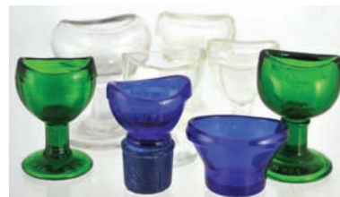
W38. EYEBATHS GRP. 4 clear glass, 2 green, 2 blue. range of moulded & freeblown, one (stopper shape base) embossed 'Wyeth'. Overall very good (8)

tel: 01226 745156 or email: sales@onlinebbr.com