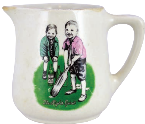
W36. TEACHERS/ WHISKY water jug. Black transfer one side, to other multicoloured large pictorial of 2 youngsters playing cricket, titled 'The Right Spirit'