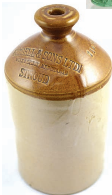
W16. STROUD 1/2 gallon, t.t. flagon. Shoulder imp'd 'Godsell & SONS Ltd/ Wine & Spirit Merchant/ Stroud'. Very good (CM)