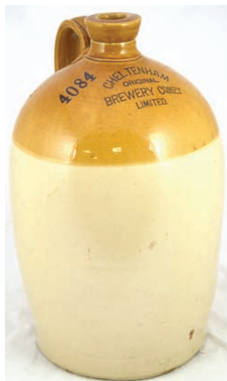
W1. CHELTENHAM 2 gallon, t.t., shapely flagon, rear handle. '...Original/ Brewery/ Company/ 4084'. Very good (CM)

Commission 15% on hammer, immediate payment taken, we bring items to you.