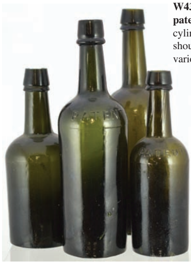
W43. POWELLS BRISTOL patent bottle group. Black glass cylinders, 2 with patent to shoulders, 3 piece moulds. Bases variously embossed (4)