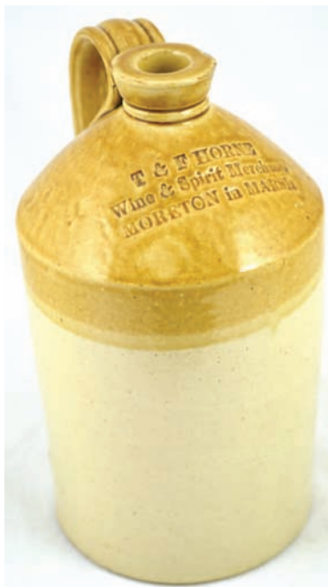
W27. 'MORETON IN MARSH' half gallon flagon. T.t, rear handle. 3 lines of imp'd writing '...Wine & Spirit Merchants/... T & F Hore'. Very good (CM)