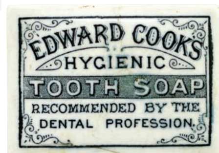
W6. 'EDWARD COOKS/ HYGIENIC/ TOOTH SOAP'. Small rectangular lid with strong black transfer. Repaired - display OK.

Tried • Tested • Trusted www.onlinebbr.com more sales... more often