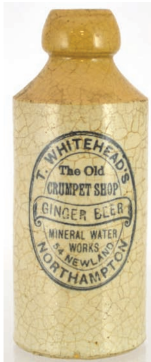
W31. T WHITEHEAD/ NORTHAMPTON, std, t.t., g.b. 8 lines of writing within oval border. Unusual address 'The Old/ crumpet Shop...' Overall crazing - should clean