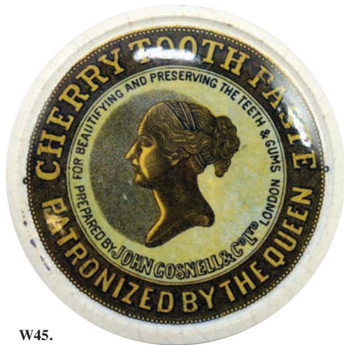
W45. JOHN GOSNELL multicoloured pot lid, predominantly brown & bluey green. Young Queen Victoria head to centre. Some minor crazing, generally very good