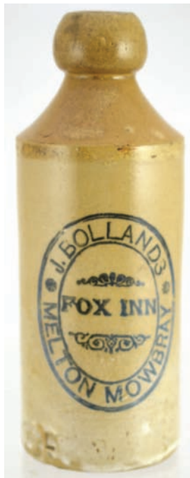
W8. J. BOLLNDS/ FOX INN. MELTON MOWBRAY, std, t.t. blob top stonie. Indistinct p.m. '.../ HITTINGTON'. Couple of bottom nibbles (TM)