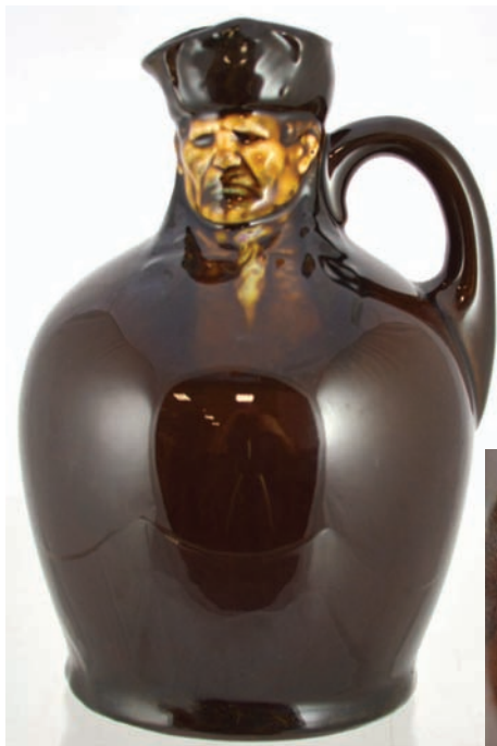
W34. BILL SYKES Kingsware flask. Globular form with overall reddish brown shiny glaze. Naturalistic head shaped neck & Bill's dog Bullseye transferred to rear. Doulton lion over crown base p.m. Very good