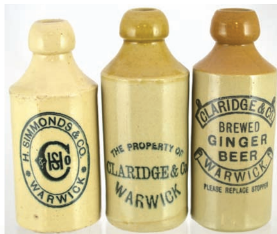
W25. WARWICK g.b. trio. All 3 std, 2 x t.t., 1 of all white. 1. H Simmonds & Co (entwined initials to centre). 2. Clarridge & Co with 3 lines of writing. 3. Another Clarridge & Co - 5 lines of writing (3)