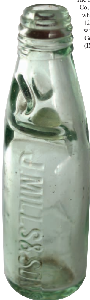
W23. J MILLS & SONS 6oz aqua codd with the familiar 3 raised rings to neck. 'Rd 43102' to rear with pict. t.m. to base, & concentric rings underneath. Fabulous condition (GM)