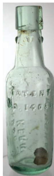
W12. BIRMINGHAM small aqua upright cylinder. Heavily embossed 'Chavasse & Kerr/ Birmingham/ patent/ No 14086'. Four unusual raised triangular sections below the long blob top (GM)