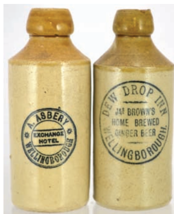
W37. Welingtonborough g.b. duo , std, t.t. 1. 'A Asbery/ Exchange hotel'. 2. 'Dew Drop Inn/ Jas Browns/ home Brewed/ ginger Beer' (lip flake). Both fairly good (2)