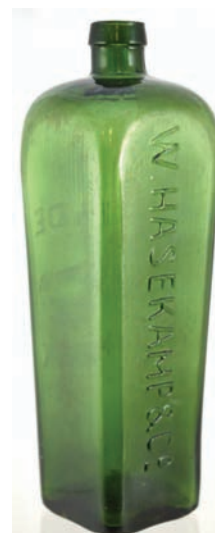
W26. W HASEKAMP & CO bright green case gin type. 9.5ins tall, square edged blob lip. Lined writing on side. Pictorial crouching lynx (?) one side. A scarce pictorial. Very good