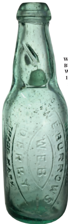
W9. 'W H BURROWS/ W.E.B/ DERBY' 10oz, bluey aqua narrow neck codd. To rear 'Codd's/ Patent/ 4/ London/ SE'. Lots of seed bubbles. A really fabulous example - great colour!