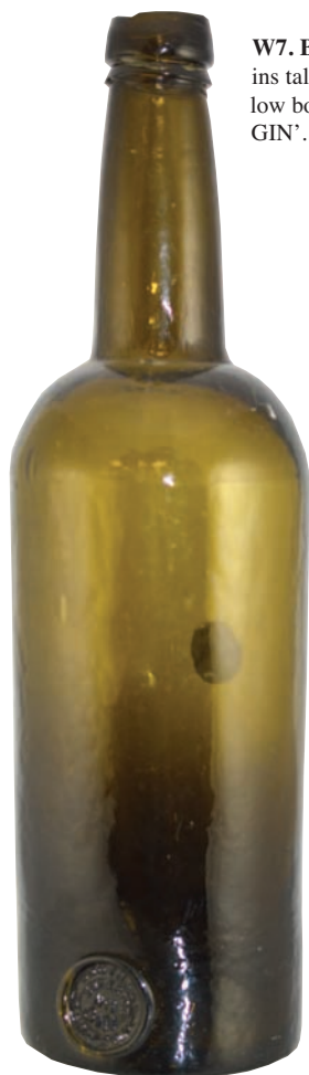
W7. BLACK GLASS SEALED WINE BOTTLE. ins tall, collar lip, 3 piece mould. Most unusual very low body seal, crisply struck 'SUPERIOR/ NO 1/ GIN'. Very good (CM)