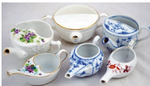
W11. ASSORTED INVALID FEEDERS. A good variety of differently shaped & transferred (blue & white & coloured) ceramic invalid feeders (6) (NL)

Tried • Tested • Trusted www.onlinebbr.com more sales... more often