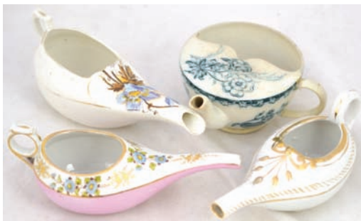
W44. INVALID FEEDERS GROUP. Various shapes, each handled & all differently transferred - 2 coloured, one gilded, other bluey green. Good (4) (NL)