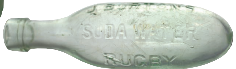
W32. J BURTONS/ SODA WATER/ RUGBY small aqua glass hamilton - quite unusual shape - less pointed than usual. Good (GM)

Absentee bidders can tel: 01226 745156 or email: sales@onlinebbr.com