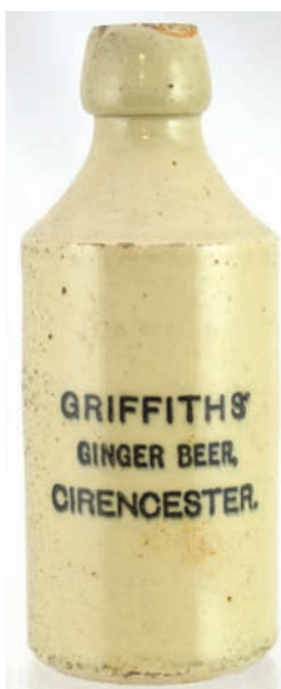
W5. GRIFFITHS/ GINGER BEER/ CIRENCESTER. Std, all white g.b., cork closure, 3 lines of black wwriting. couple of minute lip flakes (CM)

Tried • Tested • Trusted www.onlinebbr.com more sales... more often