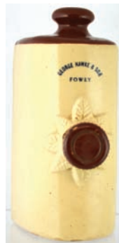
E11. GEORGE HAWKE & SON/ FOWLEY footwarmer. Brown stopper & brown top section & knop end. Good. (GM)