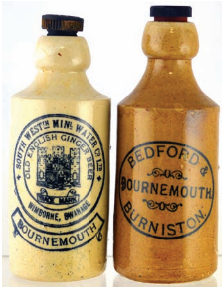
E46. DEVON AND SOMERSET valve codd. 10oz aqua, complete with valve. 'Ross & Company Limited' with 3 mineral water bottles t.m. to centre. Heavily embossed to rear. Minor haze/ wear & lip crack. (GM)