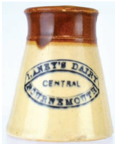
E9. LANEY'S DAIRY/ CENTRAL/ BOURNEMOUTH cream pot. T.t. church shape, black transfer. Minor bottom edge nick otherwise fine.