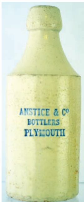
E8. ANTICE & CO/ BOTTLED IN/ PLYMOUTH g.b. All white, std, 3 lines impressed writing picked out in blue. Kennedy p.m. Minor wear. (GM)