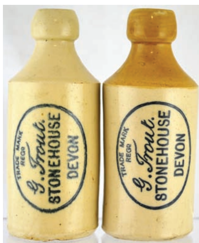
E22. G TROUT/ STONEHOUSE/ DEVON g.b. duo. Both with black transfer within outer heavy border. One all white std, other t.t., std. Both very good. (2) (GM)