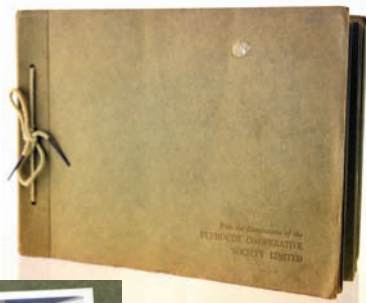
E39. PLYMOUTH CO-OPERATIVE SOCIETY album of black & white photographs. 18 in all. Most depict various department lay-outs. Very period!! Good. (GM)