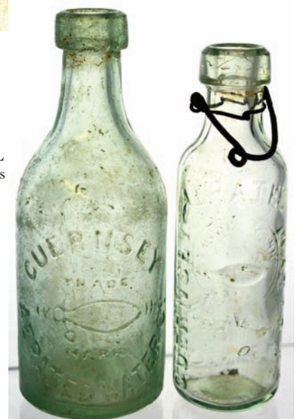
E26. GUERNSEY AQUA MINERAL DUO. Tallest 7.1ins tall, both from the Guernsey Aerated Water Co featuring hamilton pict. t.m. One squat champagne form, other with partial patent metal closure. (2) (GM)