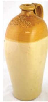
E42. SIDMOUTH flat sided flask. 10.5ins tall, t.t., padded flat sides, curved shoulder with small rear handle. Boldly imp'd '120/ H NEWTON/ SIDMOUTH'. Very good.