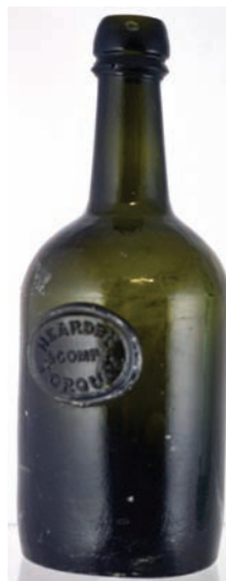
E16. HEARDER/ & COMPANY/ TORQUAY black glass sealed wine. 9ins tall, large body seal to side, 3 part mould, blob lip. Base embossed 'P & R/ BRISTOL'. Some wear.