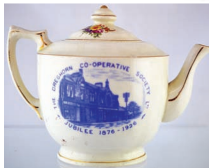
E44. DREGHORN CO-OPERATIVE teapot. Blue transfer to front & rear (different) with multicoloured floral decorated lid. Celebrating the Jubilee '...1876-1926'. Very good. (GM)