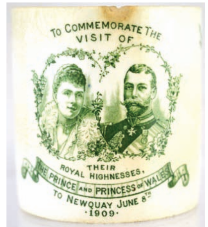
E23. NEWQUAY COMMEMORATIVE MUG. 3.4ins tall, highly detailed transfer to front & rear (round handle). Celebrates the visit of "their Royal Highnesses... Prince & Princess of Wales/ ...June 8/ 1909. Rim flake. Great looking regional piece. (GM)

CONDITION Before bidding please ensure items meet your condition requirements - so INSPECT! On sale day ALL items sold AS SEEN - NO RETURNS