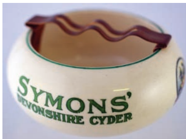
E37. SYMOND'S/DEVONSHIRE CIDER ashtray. 4ins diam, squat circular form with metal fitment to centre. Cream body, green lettering, multicoloured fruit images each side. Good.