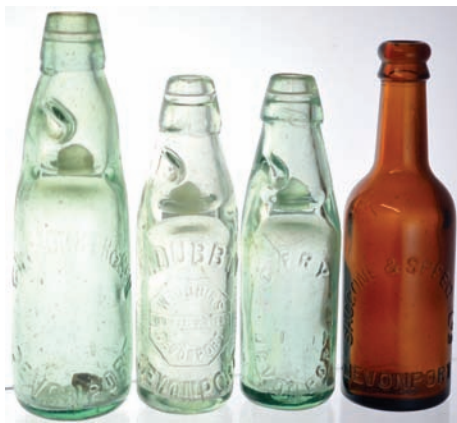
E18. DEVONPORT group of 4 minerals. 3 codd's - 10oz Crocker & Son, & 2 6oz examples - W Dubbin & G Fry, plus amber beer Salcone & Speed. Good. (4) (GM)