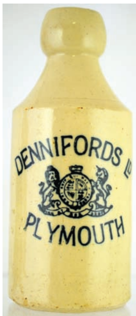
E10. DENNIFORDS LTD/ PLYMOUTH g.b. All white, std, black transfer - prominent coat of arms central t.m. (GM)