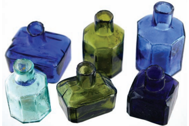
E24. SHEARED LIP INKS GROUP. Tallest 3.3ins, octagonal, square (chamfered corners) & boat - 3 blue, 2 green, 1 aqua. (6) Good. (MH)